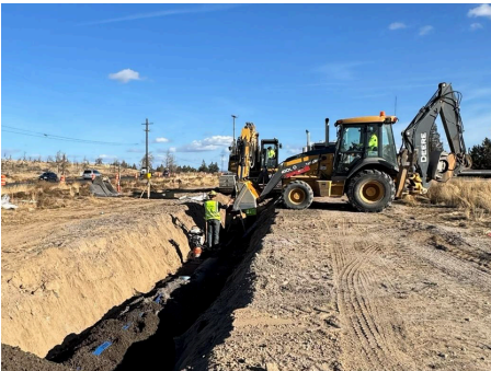
Water Main Installation