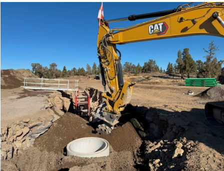
Sanitary Sewer Installation