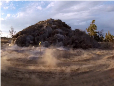
Blasting for 21 st Street