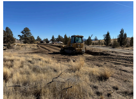
Subgrade Prep: Oasis Village