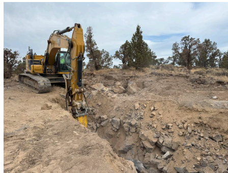
Sanitary Sewer Installation