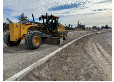
Base Prep for Paving