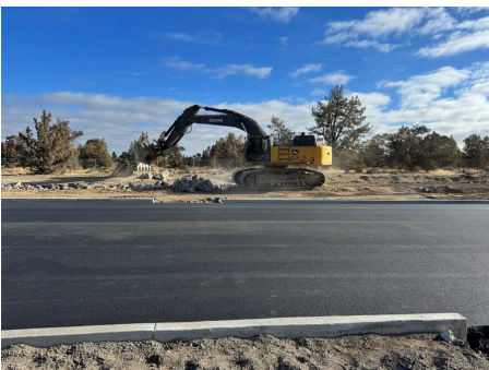
Joint Utility Trench