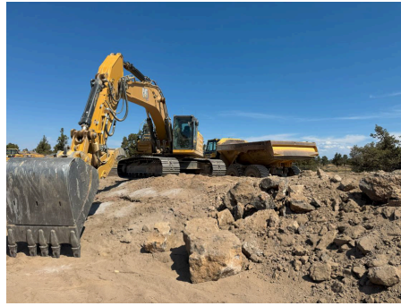
Excavation from Blast