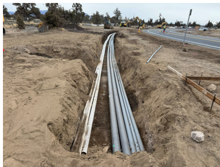
Joint Utility Installation