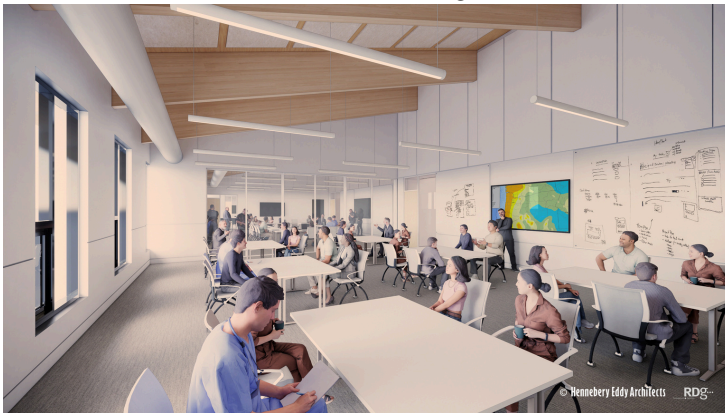
CORE3 Clean Classroom