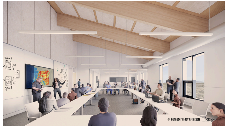
CORE3 Clean Classroom

ADMINISTRATION / EMERGENCY COORDINATION CENTER BUILDING FLOOR PLAN