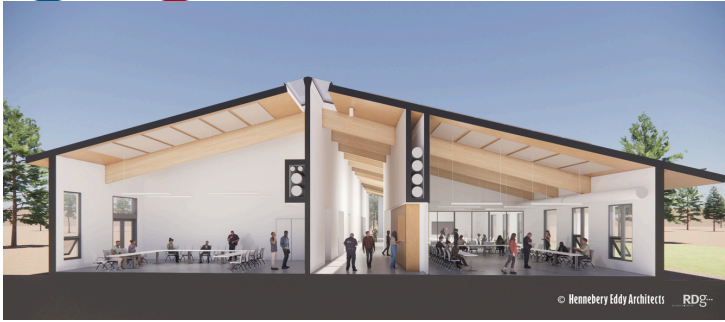
ECC Section Perspective