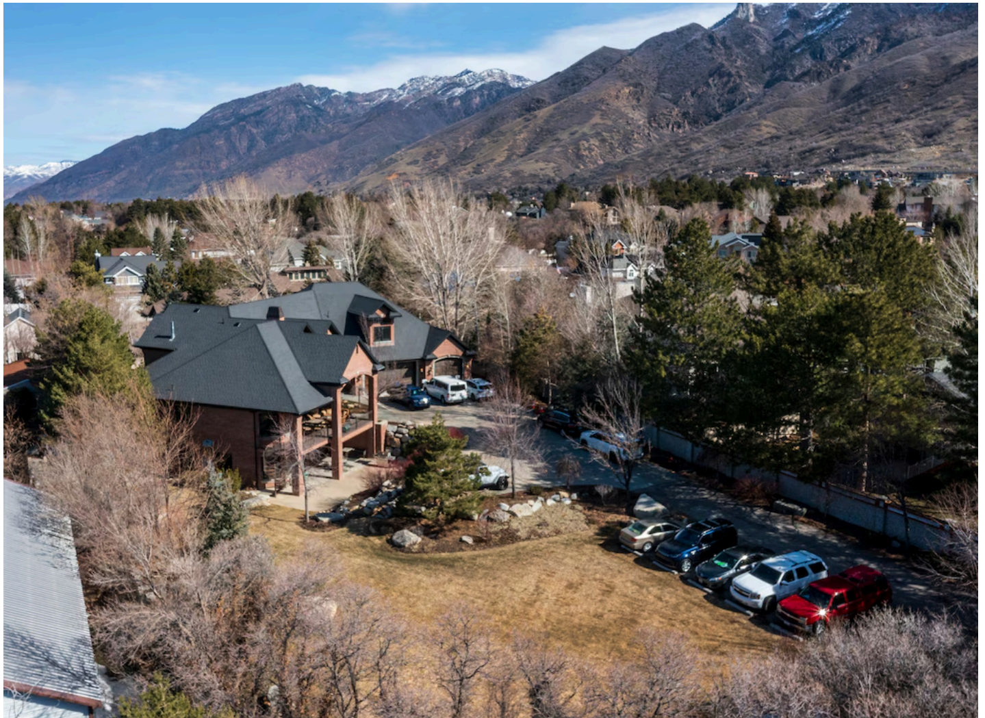
Vista Sage located at 3149 E 9800 S in Sandy, March 18, 2022. 27 former residents of Vista are suing the organization.

The lawsuit was filed Wednesday against Vista, which has locations in Sandy and Magna.