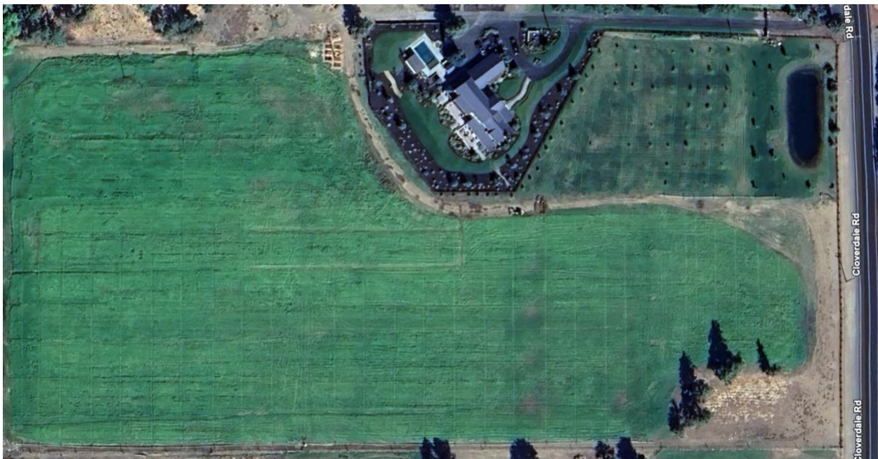
Figure 4. 67975 Cloverdale Road, Bend, Or 97759. 20 acre irrigated property zoned EFU. A 1,984sqft dwelling built in 1940 was replaced with a 5,210sqft dwelling in 2018 via application file no. 247-18-000079-AD.

Figure 3. 65050 Collins Road, Bend, Or 97701. 28 acre irrigated property zoned EFU. A 1,229sqft dwelling built in 1985 was replaced with a 4,717sqft dwelling in 2020 via application file no. 247-20-000261-AD.