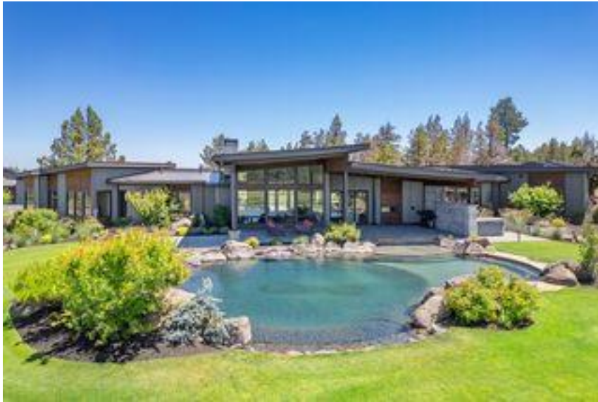
Figure 3. 65050 Collins Road, Bend, Or 97701. 28 acre irrigated property zoned EFU. A 1,229sqft dwelling built in 1985 was replaced with a 4,717sqft dwelling in 2020 via application file no. 247-20-000261-AD.

Figure 2. 64090 Tyler Road, Bend, Or 97703. 58 acre irrigated property zoned EFU. An 1140sqft dwelling built in 2007 was replaced with a 6,676sqft dwelling in 2009 via building permit number B68596. Sold for $7.15mil in 2021. The original 2007 dwelling was never removed.