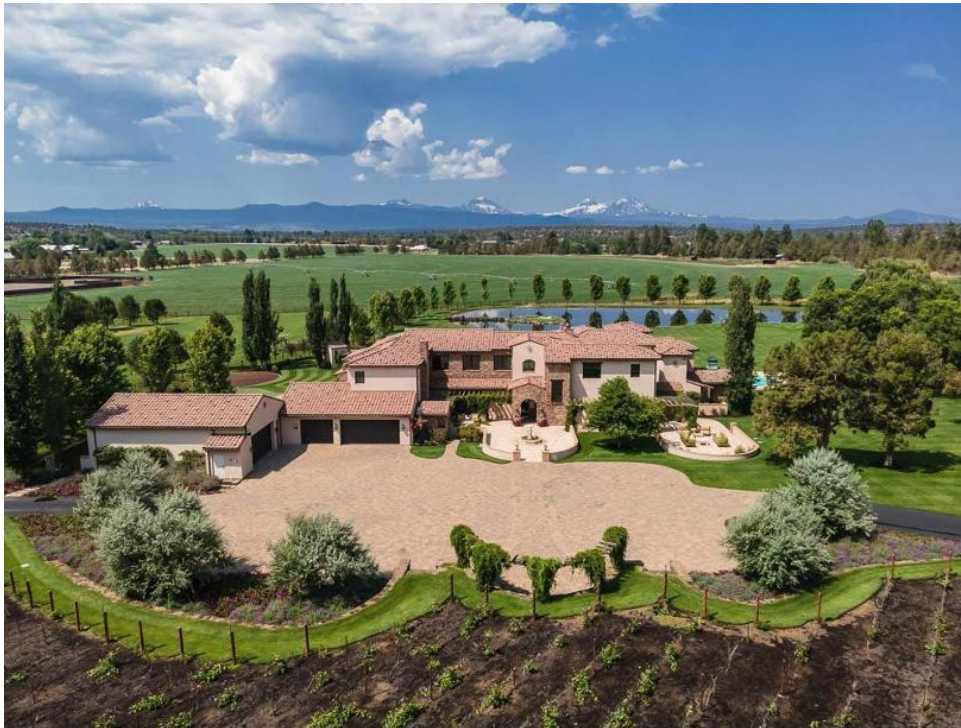
Figure 1. 65245 Cline Falls Road, Bend, OR 97703. 12-acre irrigated property zoned EFU. A 1971 manufactured dwelling was replaced with an 8,358sqft dwelling in 2008 and sold for $12mil in 2020.