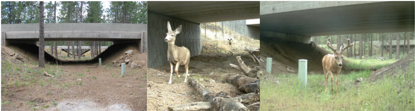
Wildlife using underpass wildlife crossings on U.S. 97 in Oregon

With roughly 6,000 deer-vehicle collisions per year alone, Oregon has a $114 million per year deer-vehicle collision problem, and elk collisions have cost Oregonians an estimated $26 million.