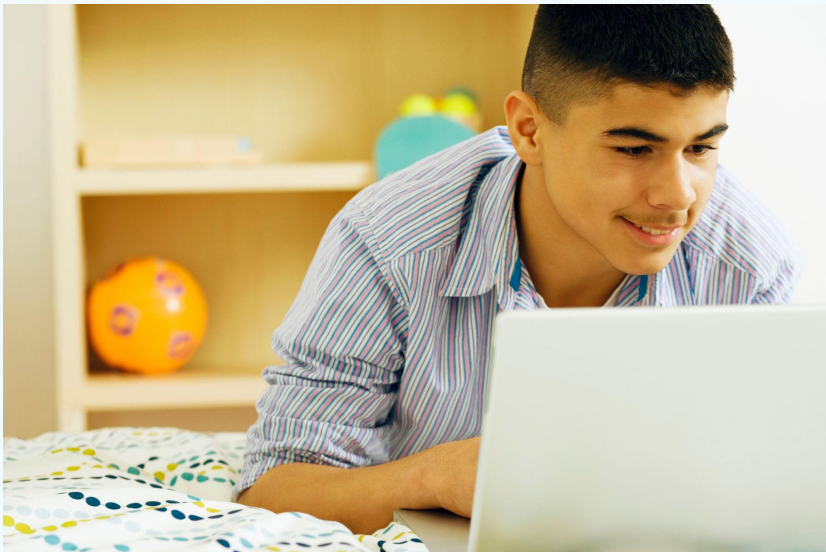
Oregon Department of Education

For online instruction, up to one hour per course per day may be counted as instructional time where the following criteria are met: