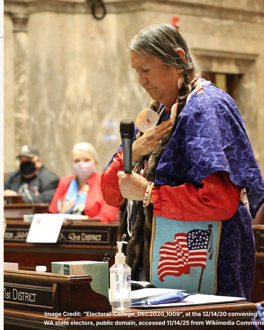
Image Credit: "Electoral-College_DEC2020_1009", at the 12/14/20 convening of WA state electors, public domain, accessed 11/14/25 from Wikimedia Commons