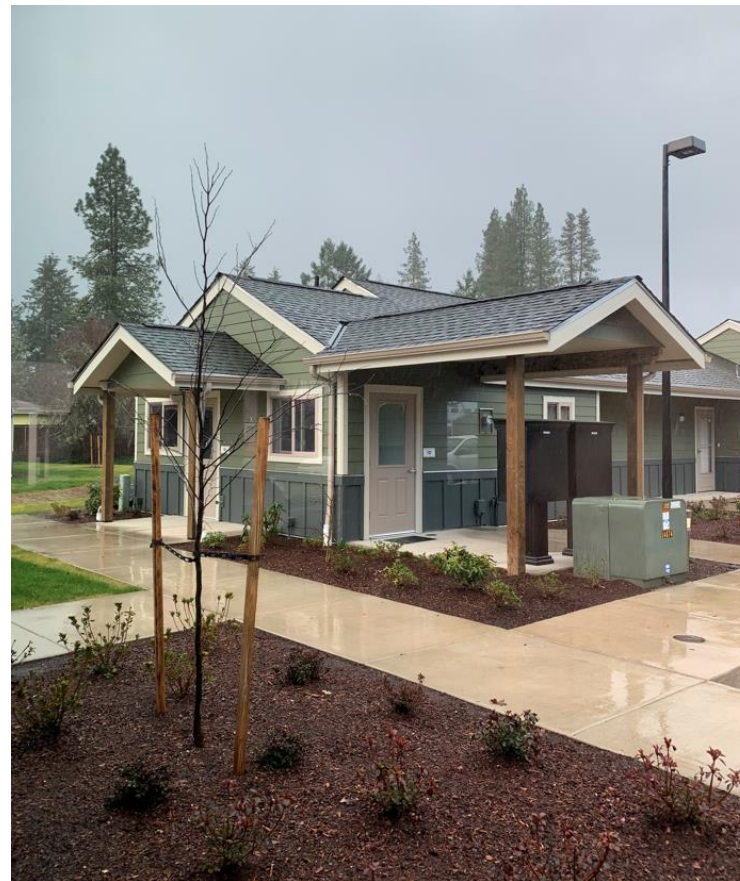
Pioneer Park, Veneta, OR