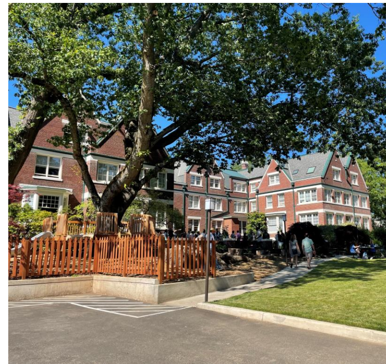
Anna Mann Apartments, Portland, OR