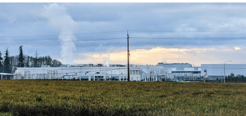
Above Left: Developed farmland on Meek Road in North Hillsboro—North Plains' fate with the city's current expansion plan.

Email: friendsnorthplainsmartgrowth@gmail.com