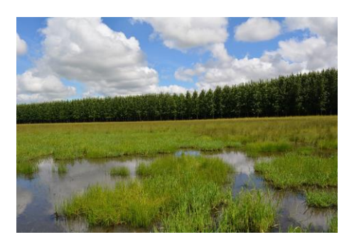
Biocycle Farm Poplar Plantation—Eugene-Springfield MWMC

programs permitted by DEQ require best management practices to ensure water quality is protected. In fact, documented improvements in surrounding water quality have been found in numerous biosolids application projects due to enriched soils and vigorous growth of vegetation that reduce soil erosion and stabilize contaminants that had previously contributed to stream and groundwater pollution (DEQ, 2018). Biosolids are not allowed to runoff into surface water (e.g., rivers, streams, ponds). Application rates for biosolids and site management practices are designed to prevent the leaching of nutrients to groundwater.