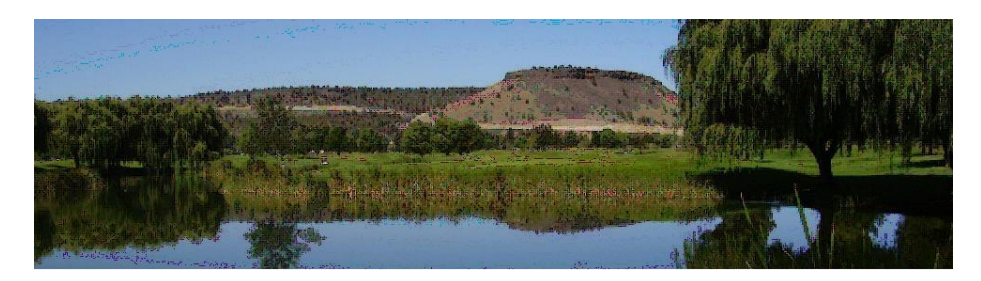
City of Prineville Municipal Golf Course—Safe Application of Recycled Water and Biosolids

Communities throughout Oregon encourage health care facilities and citizens to safely discard unwanted drugs and medications primarily using drop off boxes at secure locations or drug takeback programs and educate to not flush in the toilet. The EPA has voluntary programs such as Design for Environment Program and Green Chemistry to encourage product manufacturers to use safer chemicals.