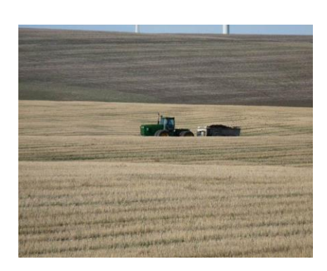
Land application of biosolids on farm fields in eastern Oregon.

The Oregon Department of Environmental Quality (DEQ) and United States Environmental Protection Agency (EPA) regulations require biosolids to undergo monitored treatment processes to kill and control pathogens and other diseasecausing organisms before leaving wastewater treatment facilities. Biosolids are <u>regularly tested</u> for certain pollutants to meet safe levels to protect human health and the environment.