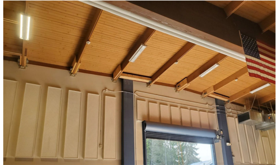
Coos Bay REEP