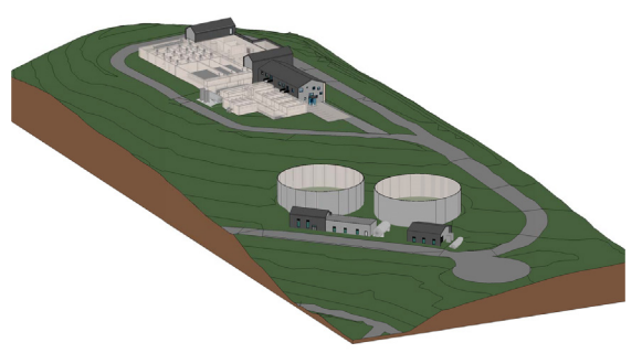
Rendering of proposed second water treatment plant

Our Request: EWEB requests the Oregon Legislature fund $24 million, or 25%, of the $97 million cost of the water treatment plant facility. This investment by the state will help ease the rate burden for EWEB customers and would also amplify regional co-benefits from EWEB water resiliency.