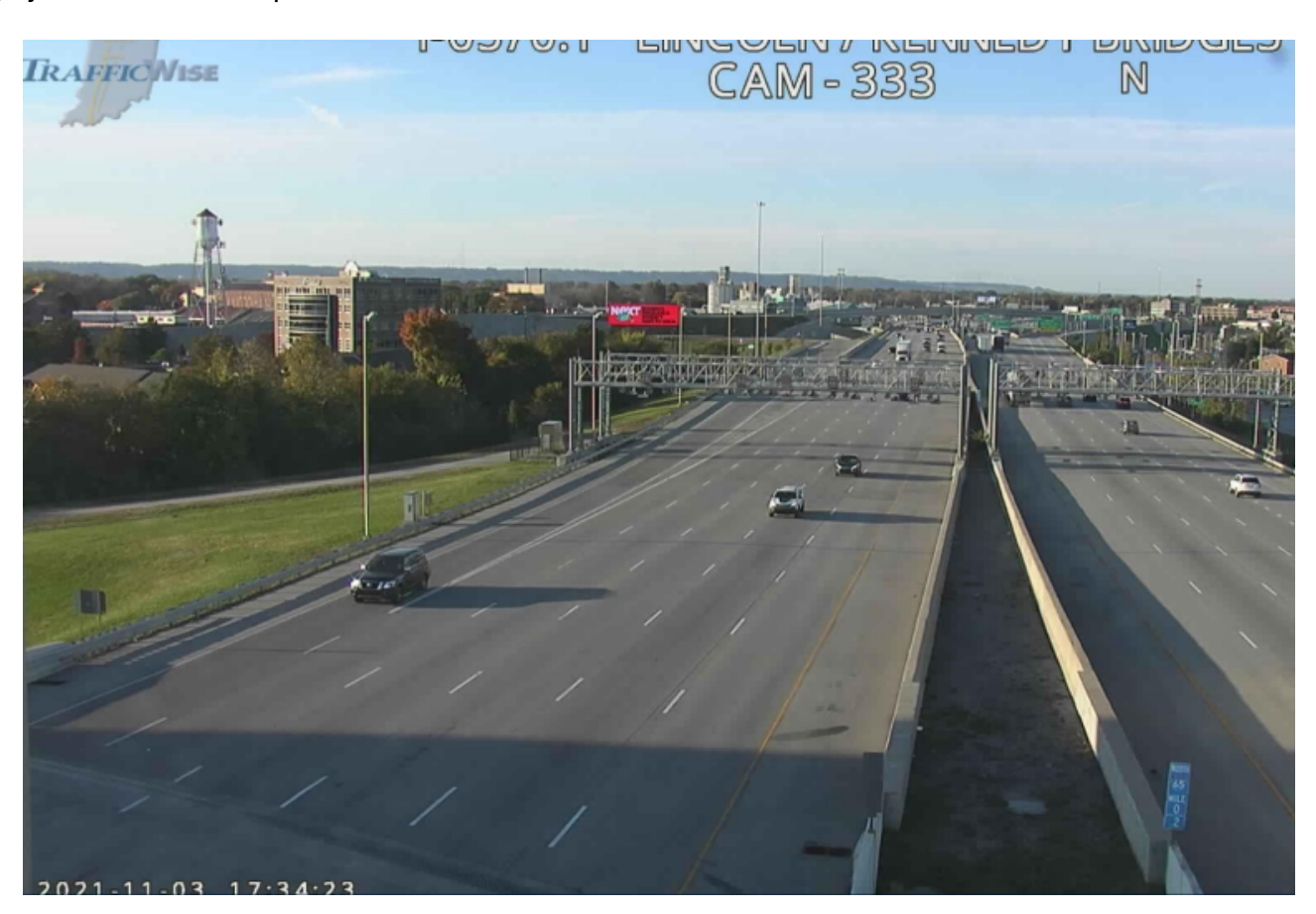
I-65 in Southern Indiana (Trimarc)

Picture this. A major interstate freeway that connects the downtown of one of the nation's 50 largest metro areas to its largest suburbs. It's a little after 5 pm on a typical weekday. And on this 12-lane freeway there are roughly two dozen cars sprinkled across acres of concrete.