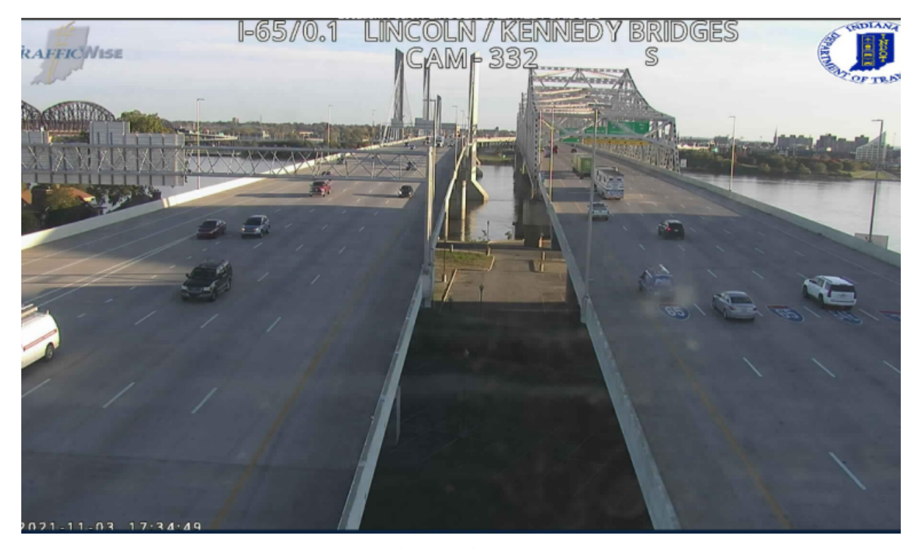
I-65 crossing the Ohio River at Louisville

These pictures were taken by traffic cameras pointed in opposite directions on the I-65 bridges across the Ohio River at Louisville Kentucky on Wednesday, November 3 at about 5:30 pm. Traffic engineers have a term for this amount of traffic: They call it "Level of Service A"—meaning that there's so little traffic on a roadway that drivers can go pretty much as fast as they want. Highway engineers grade traffic on a scale from LOS A (free flowing almost empty) to LOS F (bumper to bumper stop and go). Most of the time, they're happy to have roads manage LOS "D".