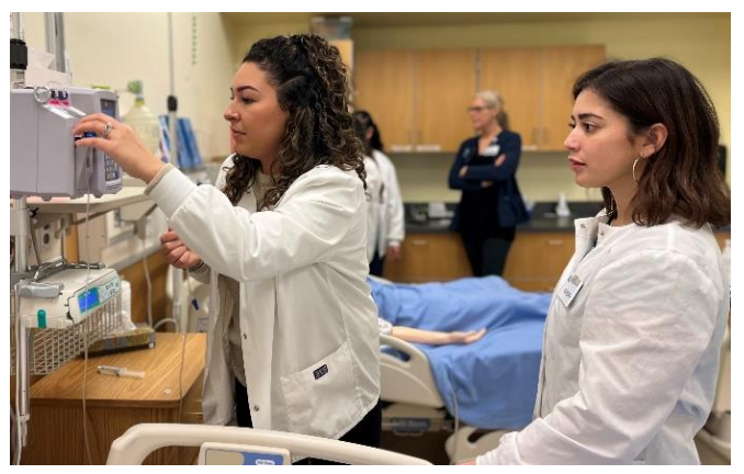
Up to 58 health careers students per year will earn credentials needed to enter the local workforce at the expanded COCC Madras campus.