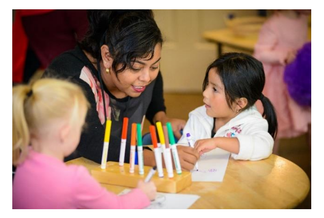
Up to 30 educators per year will be trained through the COCC Early Childhood Education program and up to 100 childcare slots will be available to the community.

For childcare, solutions include leveraged space to expand or develop childcare centers, creating a registered apprenticeship program for early education, and expanding the number of graduates from early education teacher training programs. On the healthcare side, Central Oregon's largest employer, St. Charles Heath System, has worked with COCC over the last year to expand