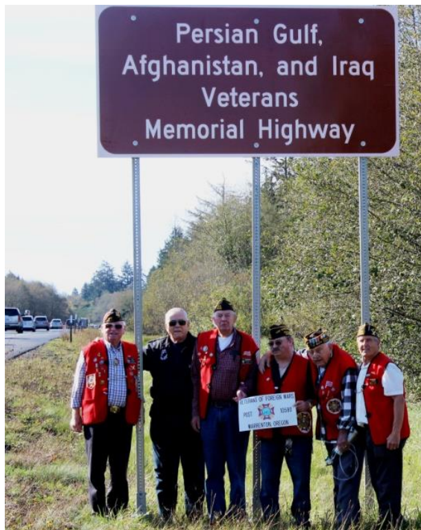
PERSIAN GULF, AFGHANISTAN, IRAQ VETERANS MEMORIAL HIGHWAY, U.S. HWY 101