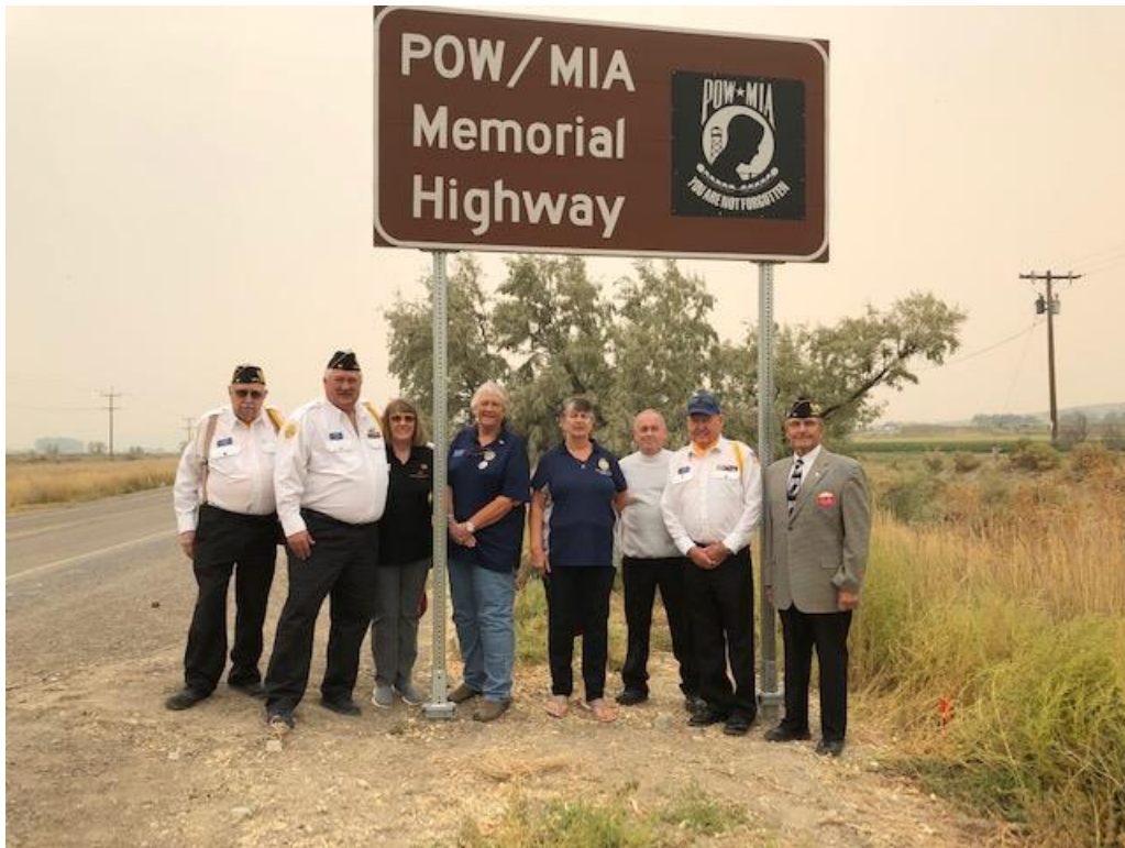
POW/MIA MEMORIAL HIGHWAY, U.S. HWY 26