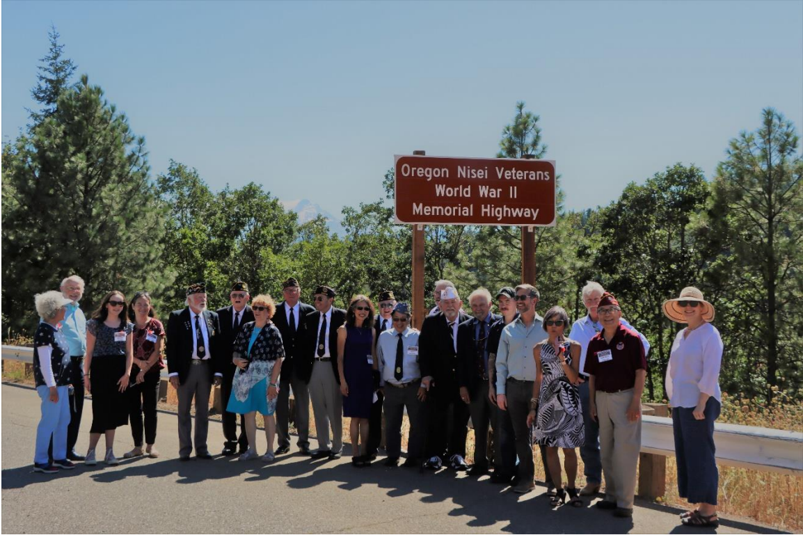
OREGON NISEI VETERANS WORLD WAR II MEMORIAL HIGHWAY, S.R. 35