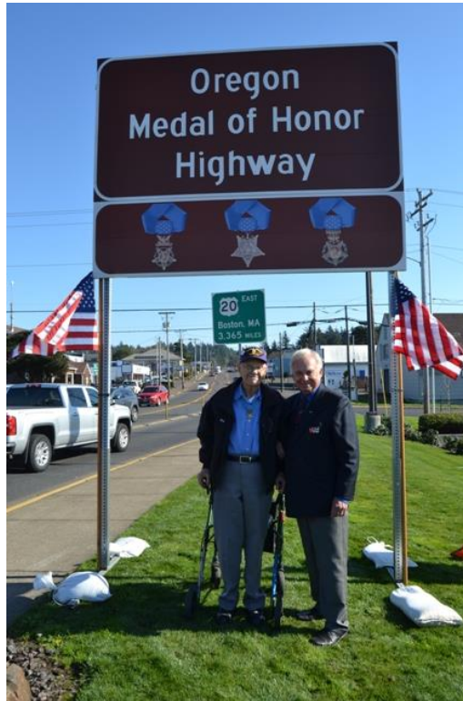
OREGON MEDAL OF HONOR HIGHWAY, U.S. HWY 20