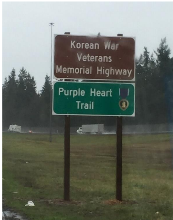
KOREAN WAR HIGHWAY AND PURPLE HEART TRAIL, I-5