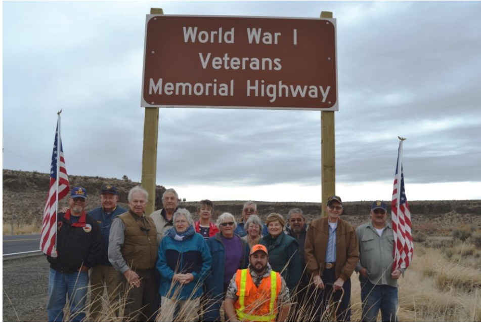
WWI VETERANS MEMORIAL HIGHWAY U.S. HWY 395