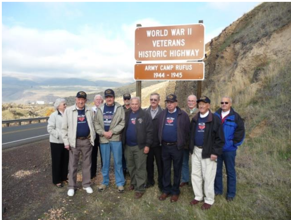
WWII VETERANS HISTORIC HIGHWAY U.S. HWY 97, PORTION S.R. 126