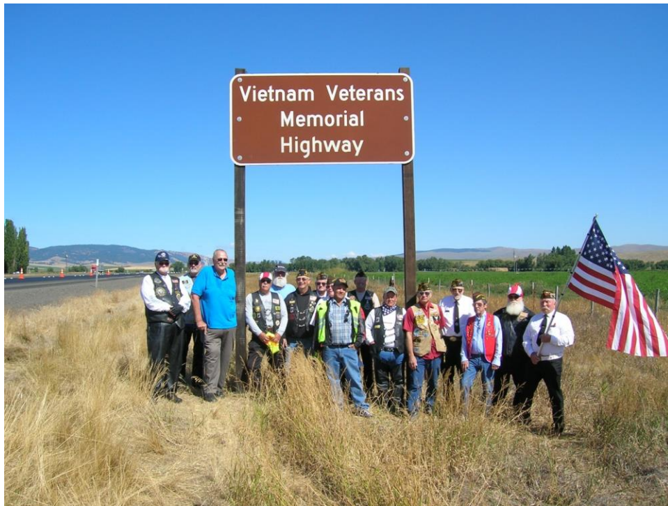
VIETNAM VETERANS MEMORIAL HIGHWAY, I-84