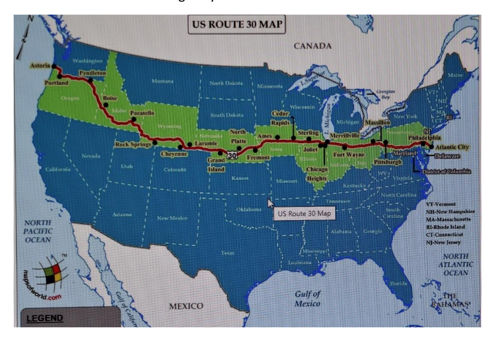
U.S. HIGHWAY 30 ACROSS AMERICA: 11 STATES, 3,073 MILES, THIRD LONGEST HIGHWAY IN USA COAST TO COAST: ASTORIA, OREGON TO ATLANTIC CITY, NEW JERSEY

U.S. Hwy 30 is the third longest highway in our nation and also crosses America from sea to shining sea: Astoria, Oregon to Atlantic City, New Jersey a distance of 3,073 miles crossing 11 states. It parallels the coast to coast Lincoln and Eisenhower highways.