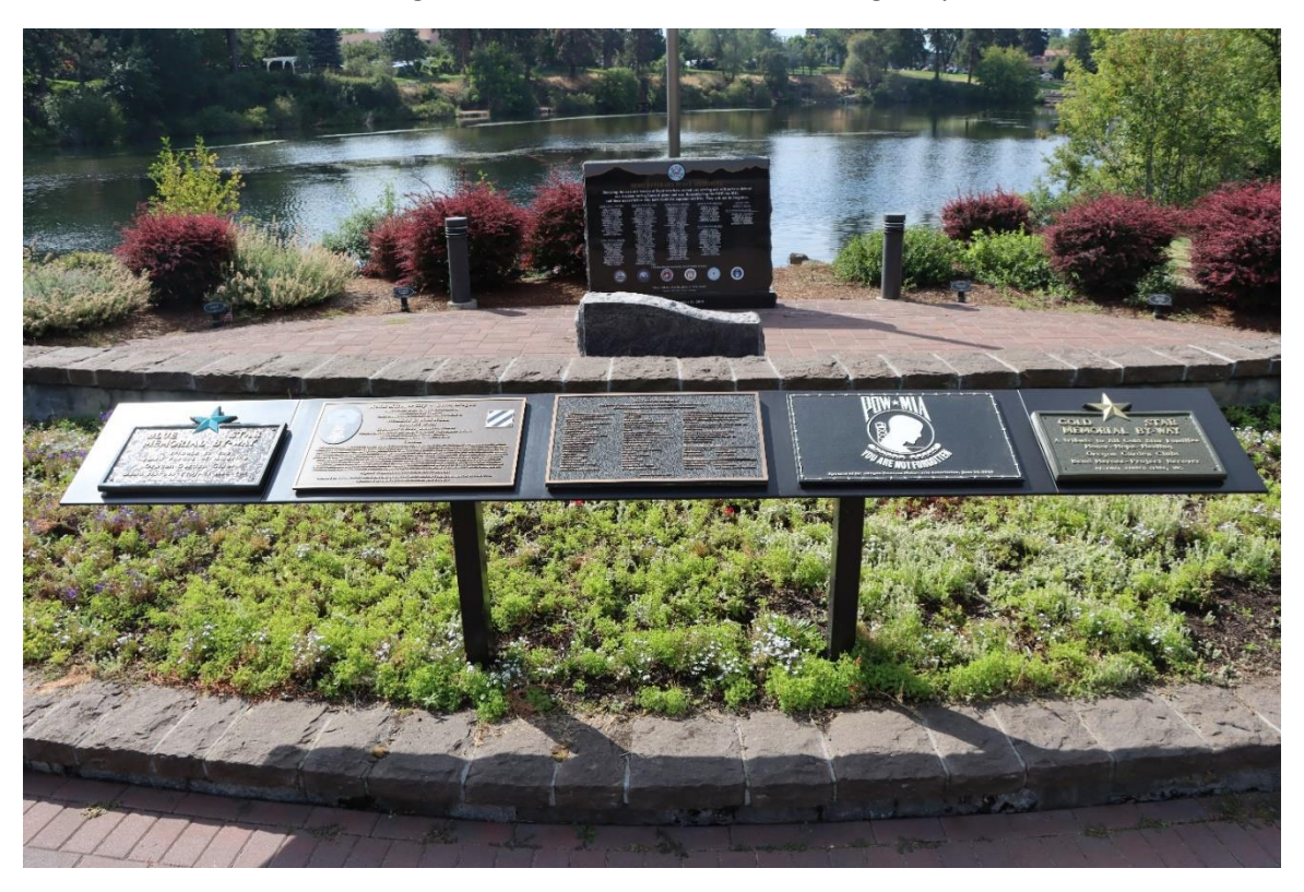
BLUE STAR AND GOLD STAR MEMORIALS AT BEND HEROES MEMORIAL

Oregon Garden Clubs is donating 2 large Gold Star Memorial markers to be installed in veterans related facilities near each end of the Oregon Gold Star Families Memorial Highway.