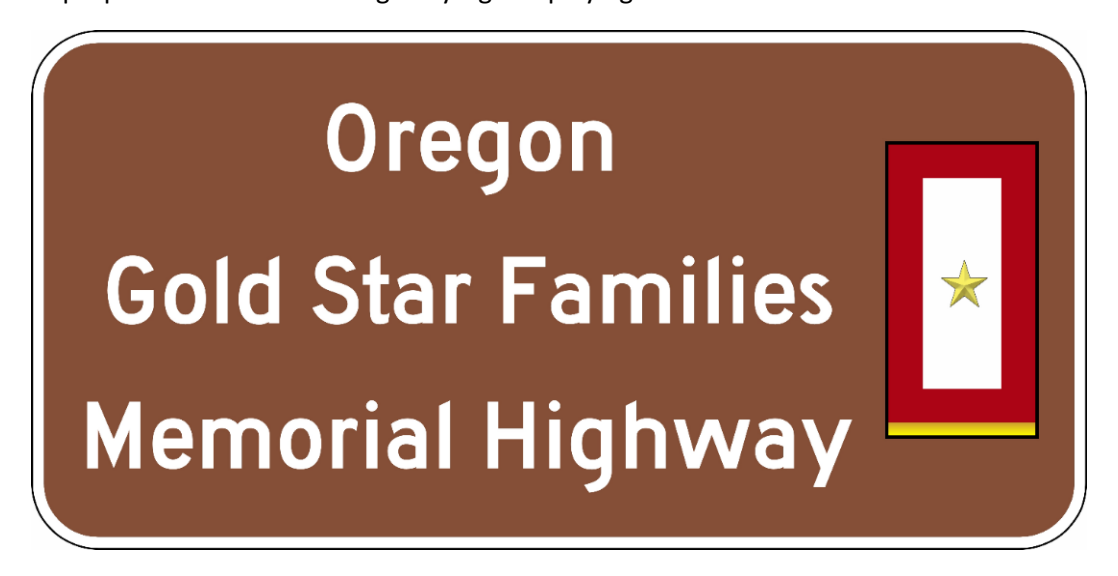
PROPOSED 4 FT. X 8 FT. OREGON GOLD STAR FAMILIES MEMORIAL HIGHWY SIGN

This is our proposed version of the highway sign displaying the familiar Gold Star banner.