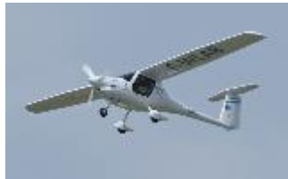
Textron Velis Electro Pipistrel