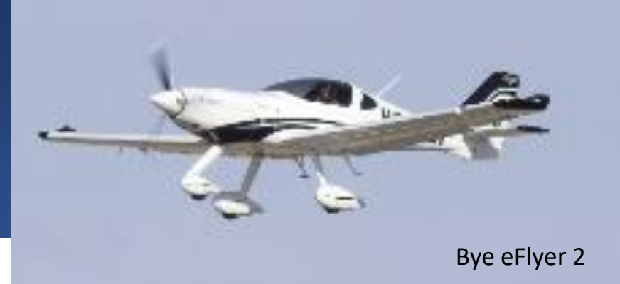
Bye eFlyer 2