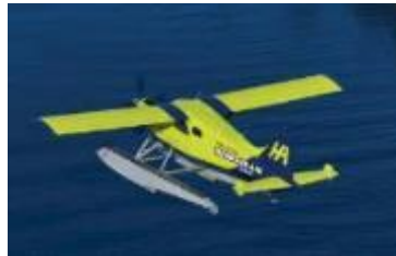
Harbour Air - magniX