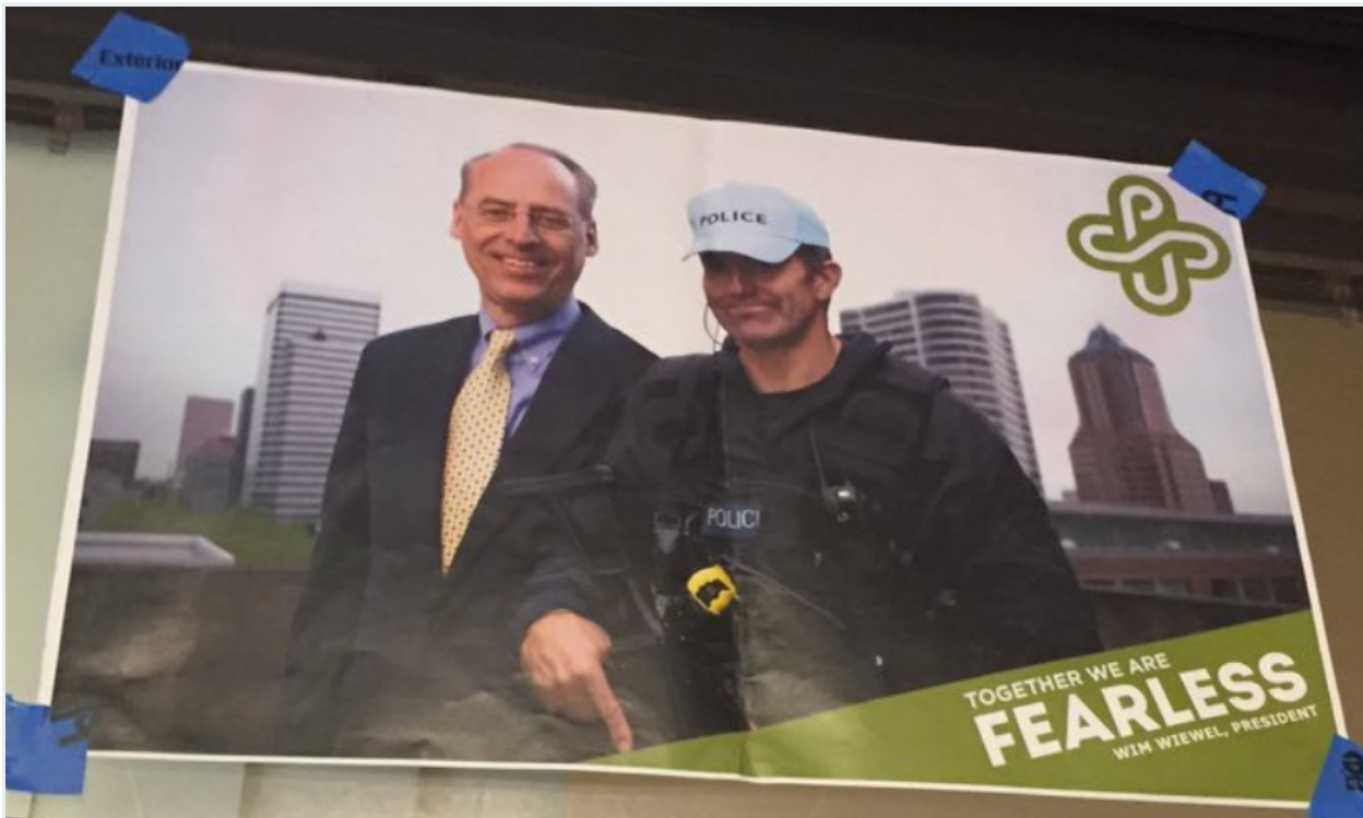
Photo: automatic rifle in the hands of police standing with former PSU President. Of course rich white people feel safe next to white cops with semi automatic weapons, but do white people consider that other people don't feel the same way and there's lots of data behind those feelings.

https://amp.theguardian.com/us-news/2019/may/02/officer-punched-oscar-grant-and-lied-about-facts-in-2009-killing-records-show?_twitter_impression=true