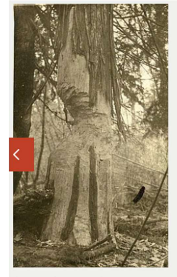
Beaver damage. Courtesy Oregon Hist. Soc. Research Lib.Org Lot 311, box 6 f61