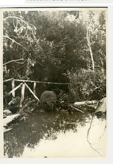
A beaver near a stream. Courtesy Oregon Hist. Soc. Research Lib., 9860011