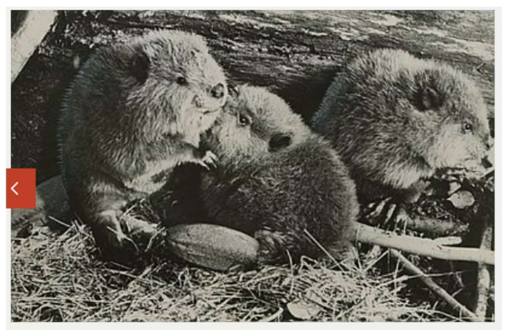
Young beavers, 1956.

In 2007, the Oregon Department of Fish and Wildlife formed the Beaver Work Group to improve communication and information on the competing benefits and costs of beaver management in the state. Biologists and researchers from state and federal agencies and tribal governments and representatives from trapping and conservation organizations, academia, landowners, and others are now working to improve understanding of beaver ecology and management.