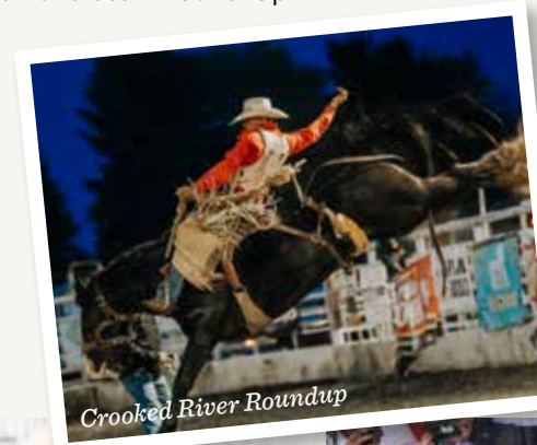
Crooked River Roundup