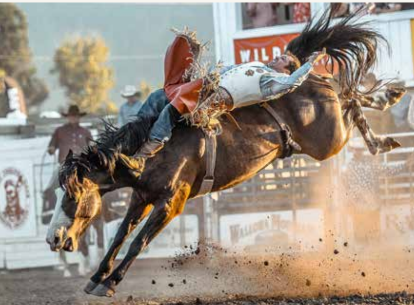
Chief Joseph Days

100 Years of Buck'n, Bronc'n, and Bust'n! This PRCA Rodeo runs on true grit and generations of volunteerism! Saddle up Labor Day weekend for a great show full of Professional Bronc riding, bull riding, bareback riding, barrel racing, calf roping, steer wrestling and more! Bring the family for the County Fair that runs concurrently through the weekend! Enjoy carnival rides, food vendors, and the 4H auction! Saturday night, catch a country star for the headline concert and make sure to hit the iconic ReRide room for a cool beverage before you see the show! See you in Lake County, Kick Your Boots Off & Stay Awhile!