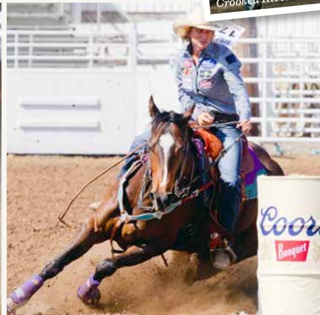
St. Paul Rodeo

There's a unique quintessence of old traditions and endless amount of history here at the Pendleton Round-Up. With the history dating back to 1910, it has become a notable attraction for tourists and history lovers. The rich cultural heritage of our Native Americans make Pendleton-Round-Up a perfect destination for unforgettable experiences you won't find anywhere else. Even rodeo fans are impressed with the frontier authenticity we've maintained for over a decade.