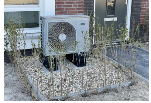
Heat Pumps a Win-Win for Cascadia's Now Hotter, Drier Summers