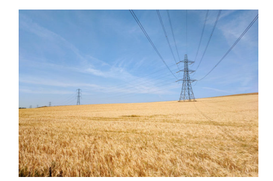
Northwest States Need to Build New Power Lines, Fast