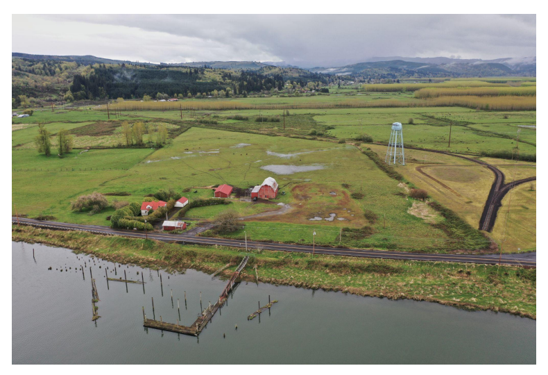
Above: Port Westward area.

The <u>refinery</u> would be one of the largest producers of non-conventional diesel on the West Coast. NEXT could make diesel from things like seed oils, animal fats, fish waste, or waste cooking oil, rather than petroleum crude oil.