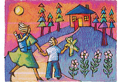
Formerly Mid-Valley Women's Crisis Service

605 Center St NE • Salem, OR 97301 • hopeandsafety.org 503-378-1572 office • 503-399-7722 hotline