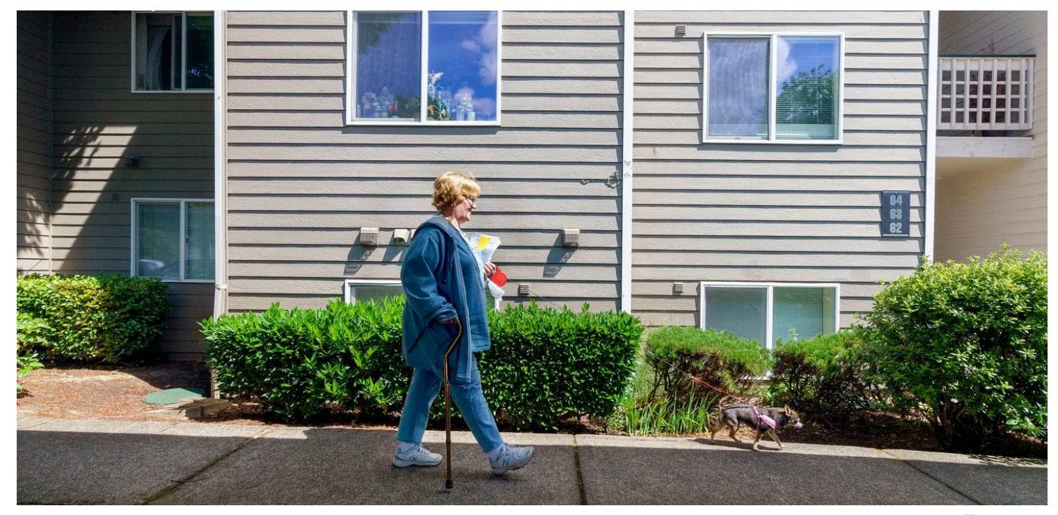
Kristyna Wentz-Graff / OPB

A Portland suburb is poised to lose one-fifth of its affordable housing. Experts say it's the tip of the iceberg.