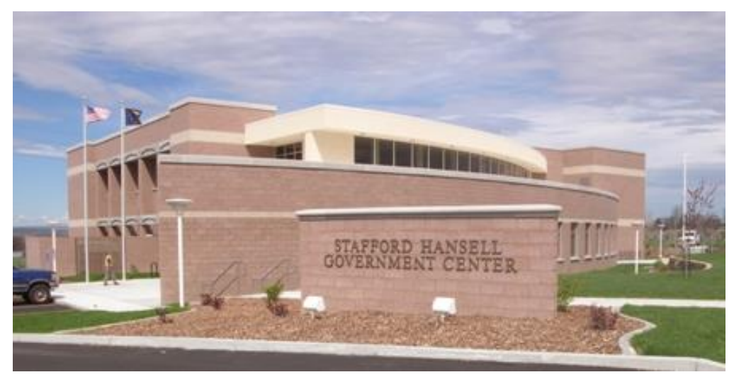
STAFFORD HANSELL GOVERNMENT CENTER AT HERMISTON