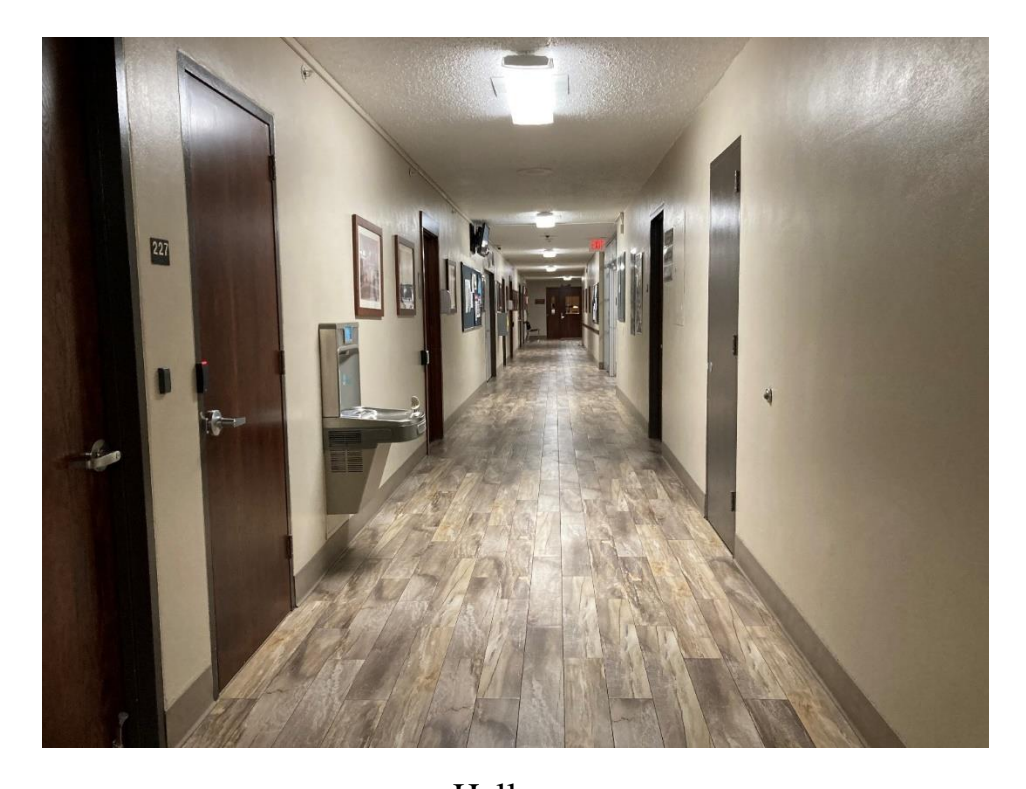
Hallway View from in front of holding cell looking toward the public entrance located 3 doors down on the right