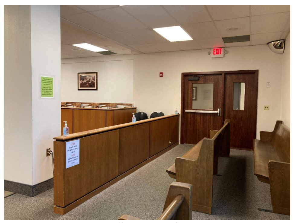
Courtroom #3 Note beam with green post obstructing the view of spectators/defendants seated in the spectator benches.