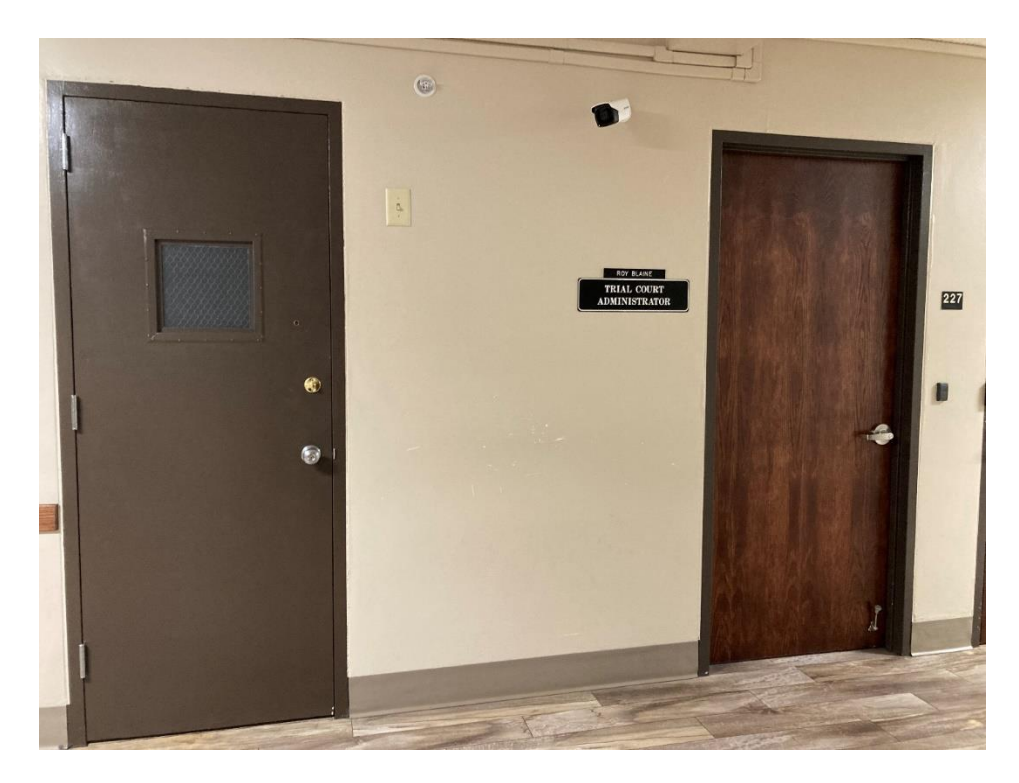
AIC Cell and the TCA office in the Hallway