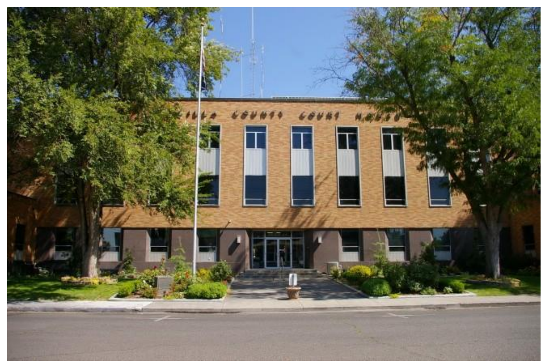
Umatilla County Court House - Pendleton (2012)