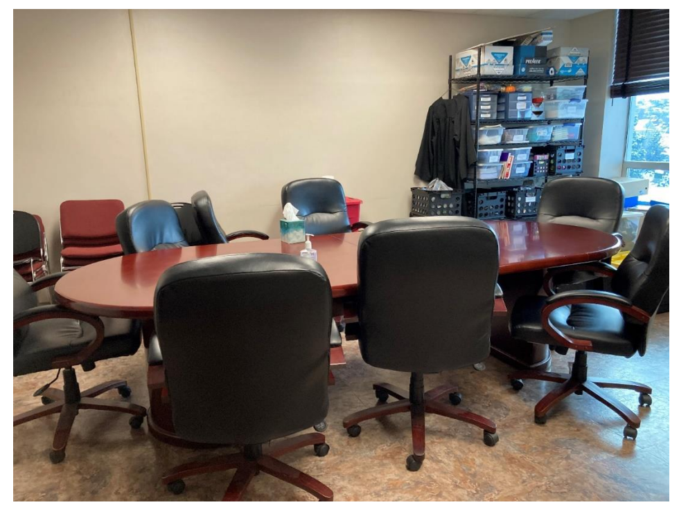
Jury Room in Courtroom #2