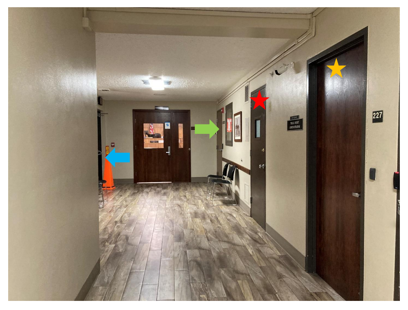
Main Hallway and AIC cell

Yellow Star on 227 door is TCA office. Red star is holding cell. Green arrow is judge access to chambers. Blue arrow is staff access to secure office space, directly across the hall from holding cell.