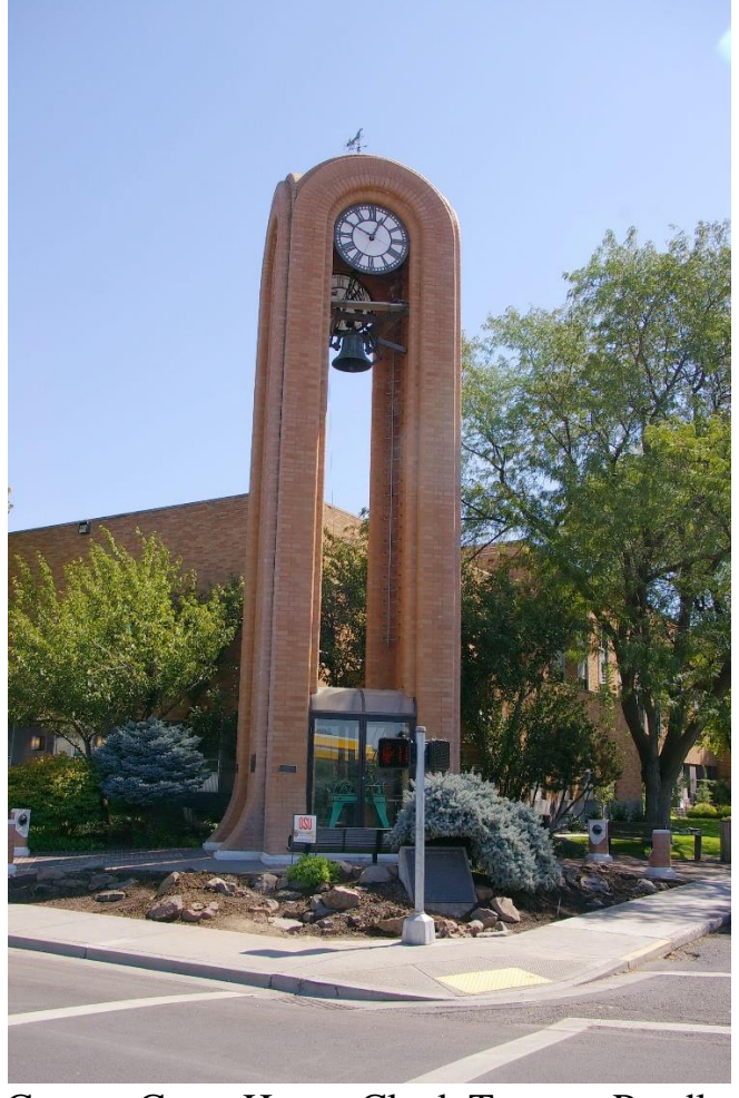
Umatilla County Court House Clock Tower - Pendleton (2012)