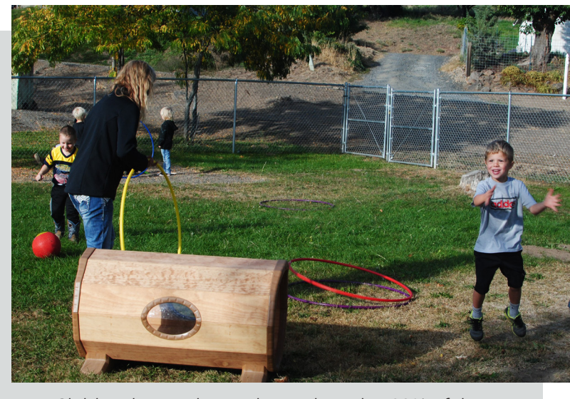
Children learn, play, and spend nearly 100% of their time outside at Tygh Valley Head Start, Mid-Columbia Children's Council.

In 2017, Washington passed SB 5357. The bill successfully established a four-year pilot project during which outdoor preschools operated for full days while working with state agencies and lawmakers to establish a path to licensure for outdoor preschools. In 2021, Washington became the first in the nation to permanently license outdoor, nature-based child care for preschool and school-age children under SB 5151. These bills addressed the same regulatory challenges that Oregon outdoor preschools face, and so we propose that Oregon pass an analogous bill or explore other policy pathways to licensure in 2023.