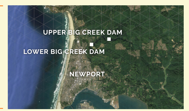
The Big Creek Dams are located in the City of Newport, on Oregon's Central Coast.