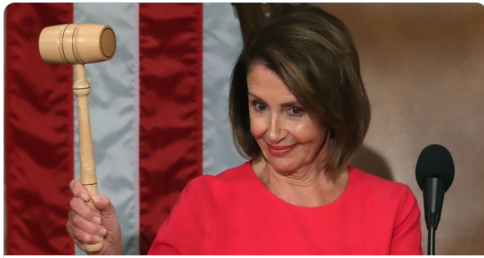
Pelosi wants to lower the voting age to 16; it should be raised to 25 - Independence... Science has discovered that the brain does not fully mature until age 25... The record of governance in most countries that allow 16 year olds to vote—Brazil, ... i2i.org

In 1900 a 21-year old frequently was a self-supporting taxpayer with a job, a spouse, and a deep stake in society. Today many of that age live an unanchored life at the expense of parents, the government, loans, and grants. #copolitics #VotingAge