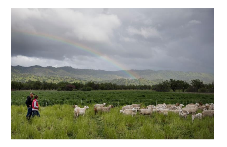
A Climate Change Solution Beneath Our Feet

The study was funded by the National Science Foundation.