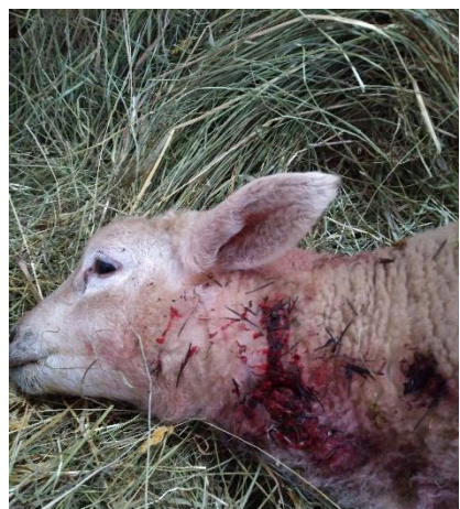
Figure 1: This lamb is alive 2 hours after I retrieved it from the field.

The loss of the other two lambs is easy to quantify. I lost about $150 of income from each of them. Quantifying the time, effort and supplies to bring a lamb back to life is impossible, certainly it was more costly than the $150 I eventually sold it for. I gave the lamb many shots of antibiotics, used iodine to clean the wound, fed it juice with a syringe to give it energy boosts, gave it several different vitamin and mineral supplements (both orally and by injection) to boost its immune system and had to teach it to drink from a bottle. Its injuries were such that it couldn't stand, let alone nurse from its mother. I had to do physical therapy with it three times each day as I was feeding it, trying to get it to stand and regain use of its front legs. I kept grain in front of it, hoping it would learn to eat something that it had never seen before because it needed any kind of nutrition it could get to fight infection and regain strength. Bite