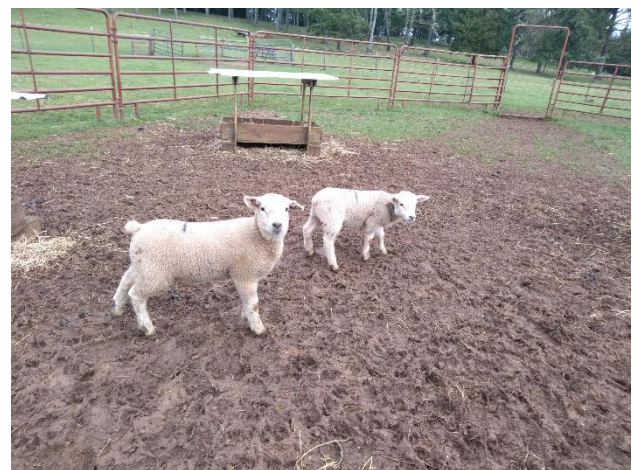
Figure 3: Lamb with its twin sister which grew substantially in the time that the lamb was in the sick ward. Even at this point you can see the difference in the development of the front leg muscles and that it doesn't stand correctly.