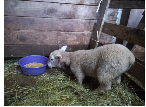
Figure 2: The lamb couldn't stand on its own.