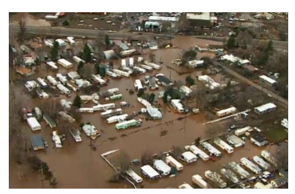
When levee systems fail: the aftermath of the 1948 Vanport Flood and the 2020 Pendleton Flood