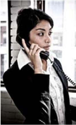
An adult child may contact your office to provide information about his or her parent, or to seek it.

card, saying to the parent: "That's wonderful to have such a helpful child. Let's you and me get together first and get acquainted, since you are the client. We'll call your daughter in if we need her." Generally, if the parent has sufficient capacity to engage legal representation, we won't need the child at all, and the dignity of both of them has been preserved.