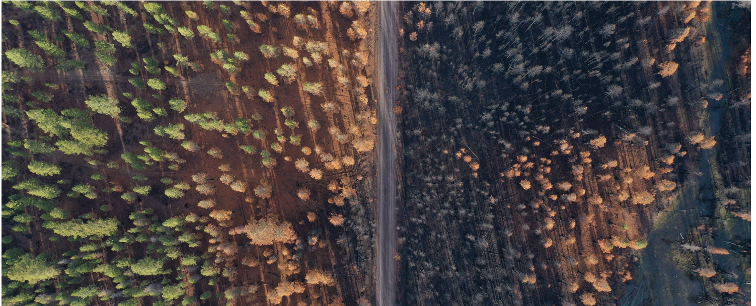
As the Bootleg Fire burned through this area from the bottom of the image to the top, the area seen on the left, which had been previously treated with mechanical thinning and controlled burning, fared significantly better than the untreated area on the right.

Early Analysis: Controlled burning was key to lowering fire severity during the 2021 Bootleg wildfire.