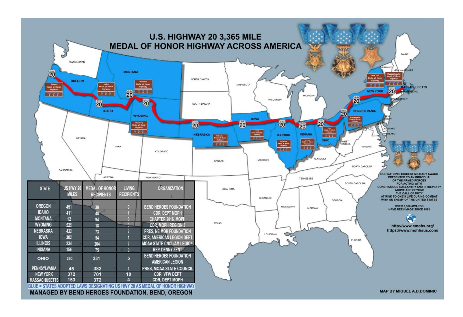
ALL 12 STATES ALONG US HWY 20 HAVE ADOPTED LAWS CREATING STATE MEDAL OF HONOR HIGHWAYS ACROSS THE COAST TO COAST 3,365 MILE US 20 HIGHWAY HONORING 60% OF OUR NATION'S 3,515 MEDAL OF HONOR RECIPIENTS FROM ALL 50 STATES