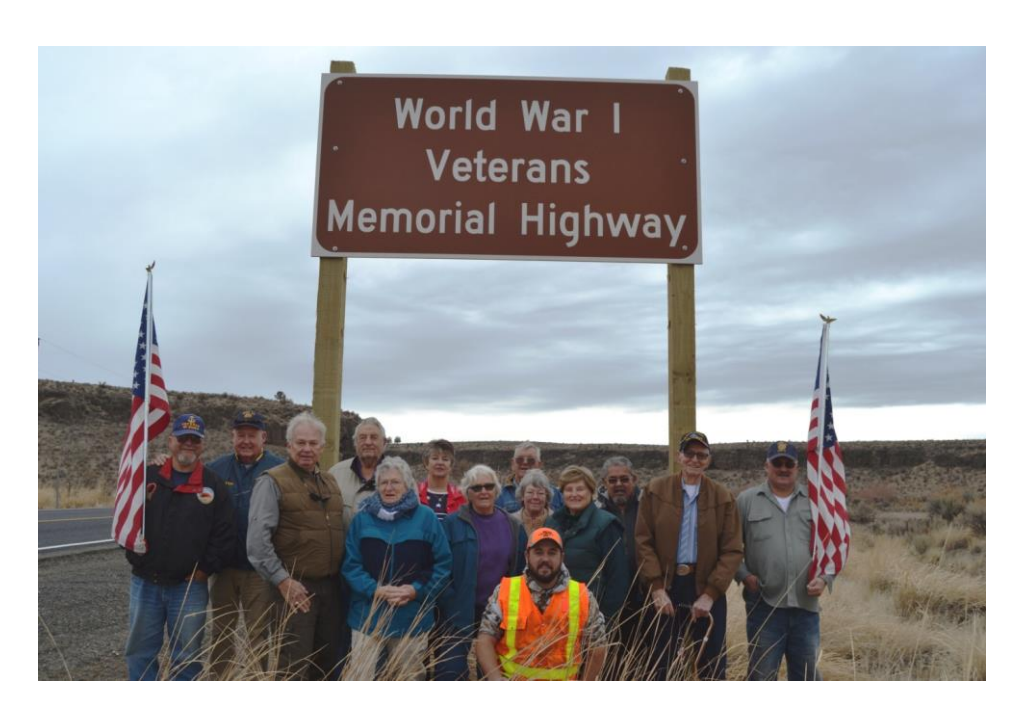
WWI VETERANS MEMORIAL HIGHWAY U.S. HWY 395