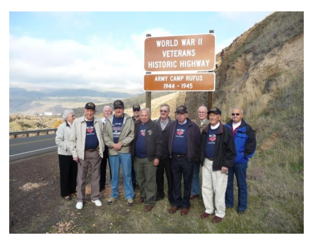
WWII VETERANS HISTORIC HIGHWAY U.S. HWY 97, PORTION S.R. 126