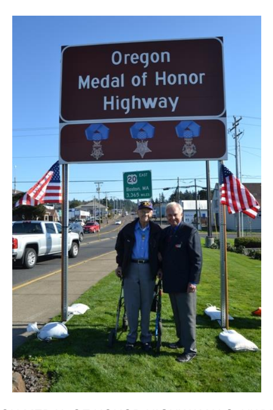
OREGON MEDAL OF HONOR HIGHWAY U.S. HWY 20