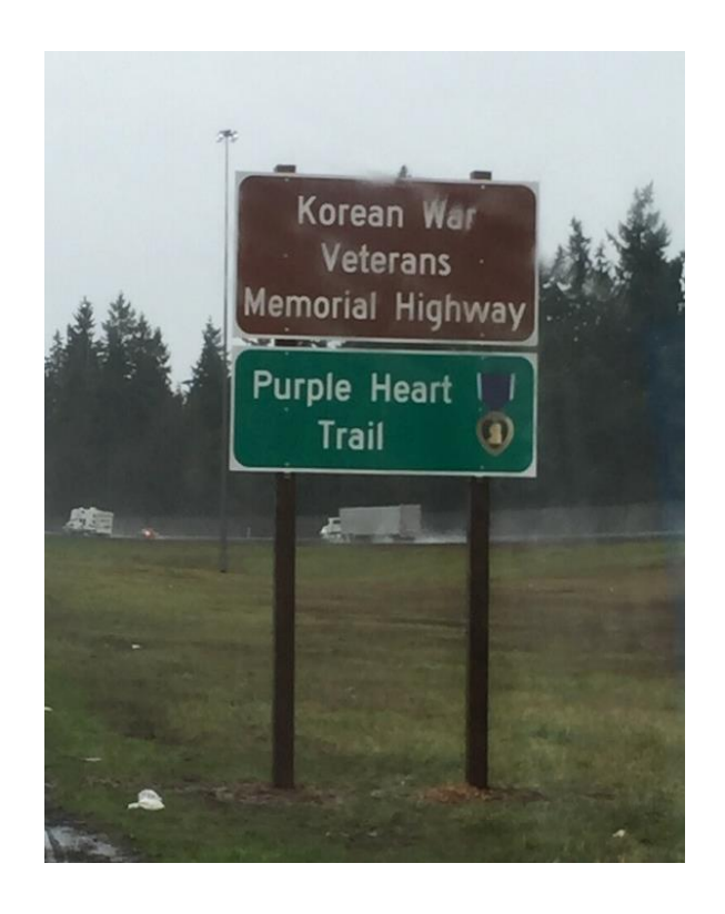
KOREAN WAR HIGHWAY AND PURPLE HEART TRAIL I-5