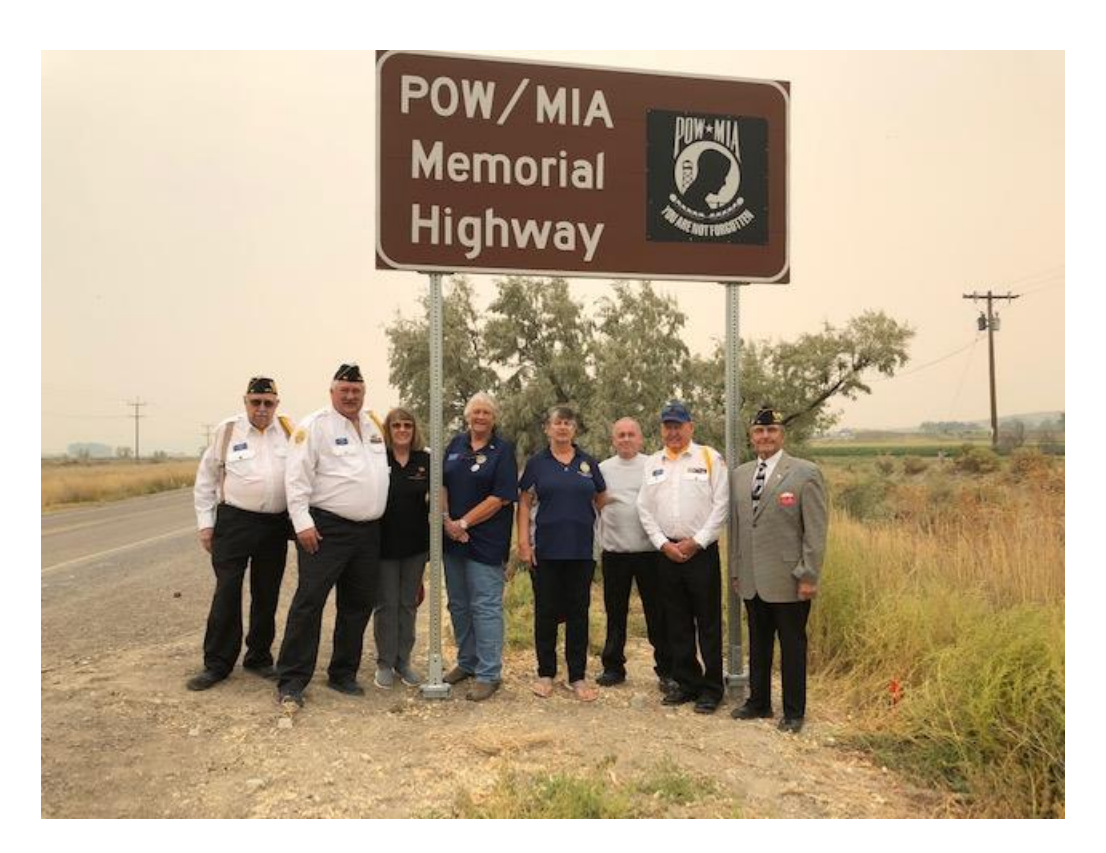
POW/MIA MEMORIAL HIGHWAY U.S. HWY 26