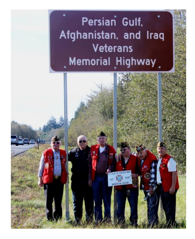
PERSIAN GULF, AFGHANISTAN, IRAQ VETERANS MEMORIAL HIGHWAY U.S. HWY 101