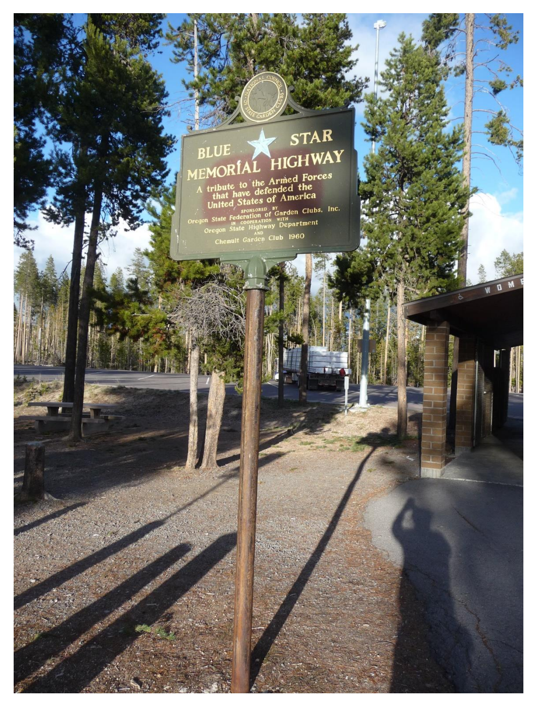
TYPICAL OF 86 BLUE STAR MEMORIAL HIGHWAY SIGNS INSTALLED ACROSS OREGON TYPICALLY IN REST STOPS