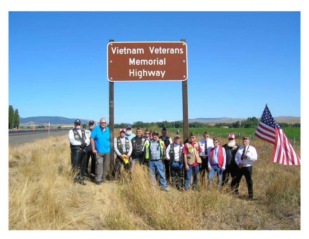
VIETNAM VETERANS MEMORIAL HIGHWAY I-84