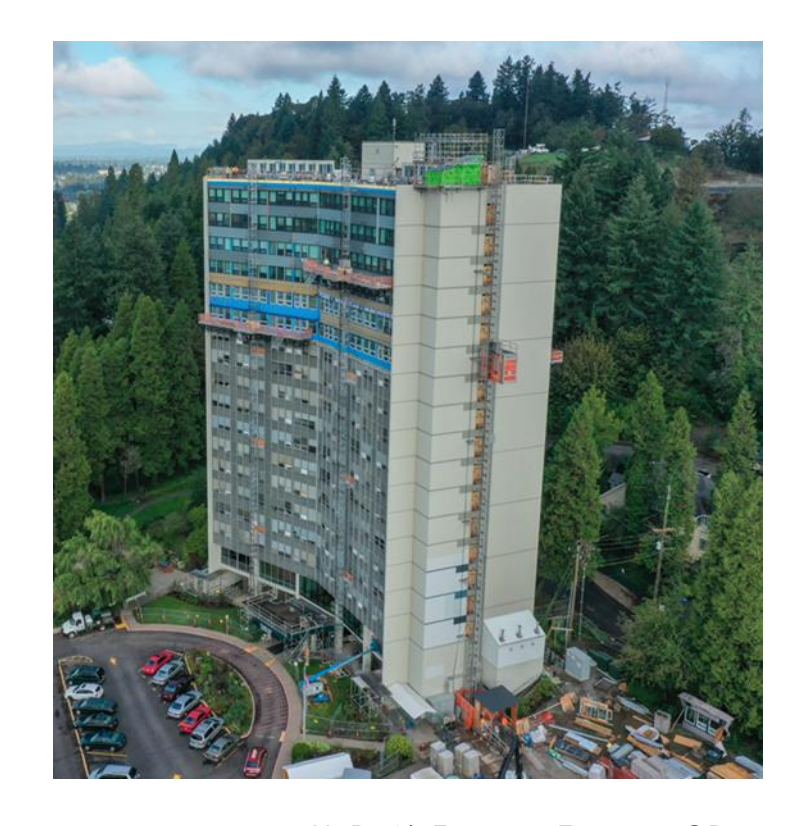
YaPoAh Terrace, Eugene, OR