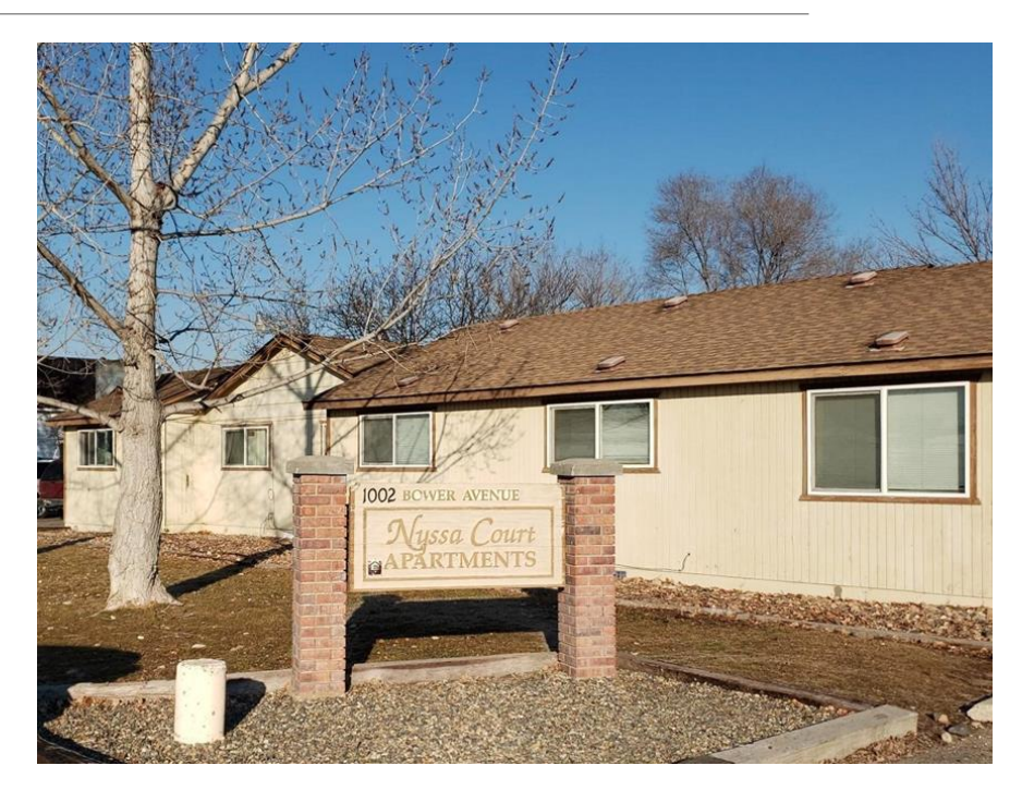
Nyssa Court, Nyssa, OR