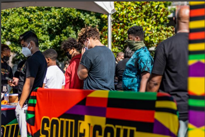
Soul2Soul Black Community Health Festival