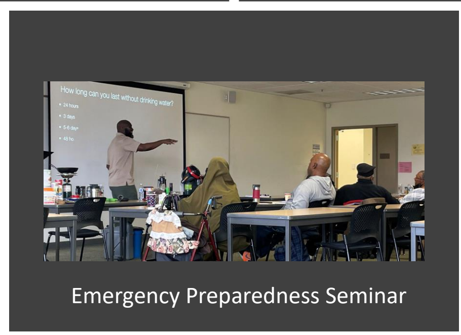
Emergency Preparedness Seminar