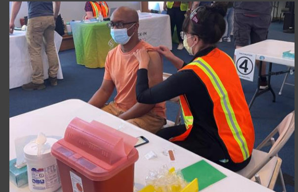
Black-led Community Vaccine Event