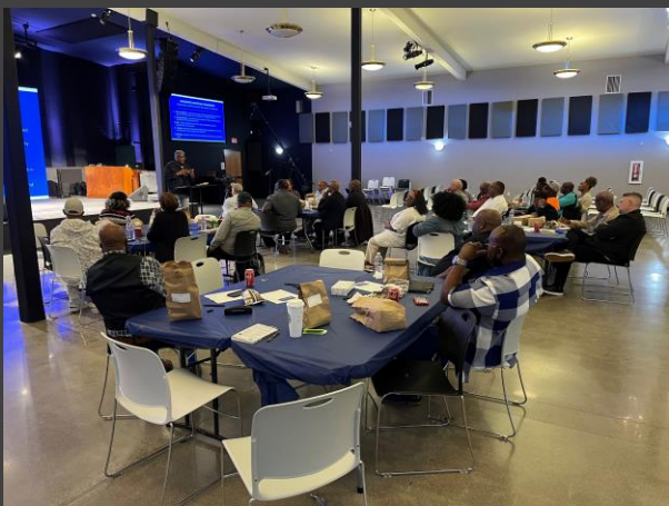
Black Faith Leaders Community Health Forum