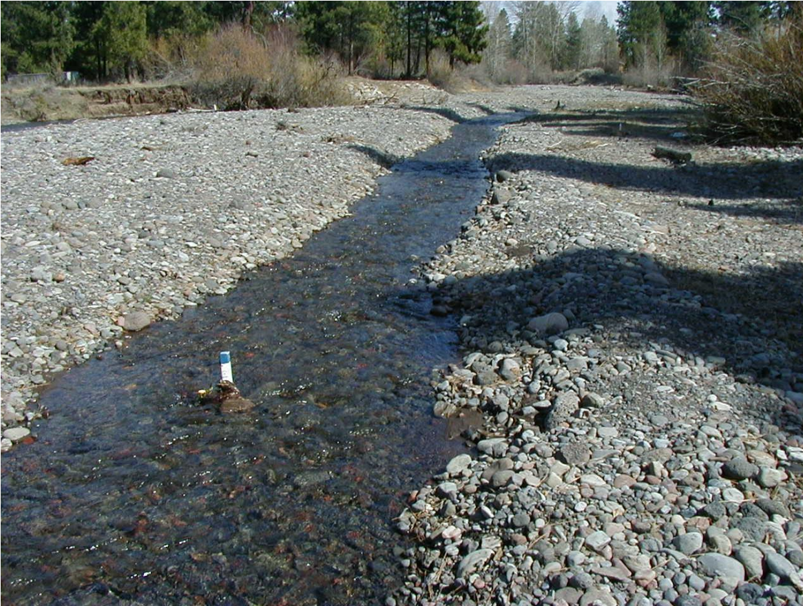
Whychus Creek Pre-Restoration