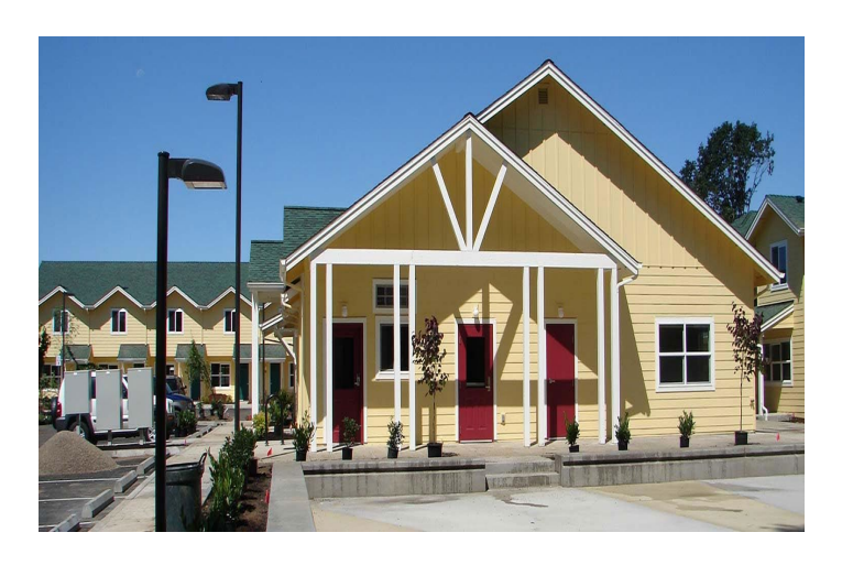
Colonia Amistad, Independence 2.3.4 bedrooms