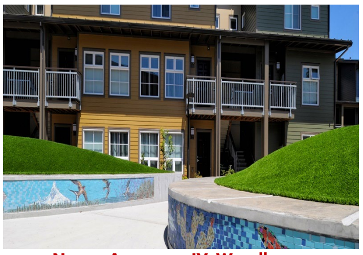
Nuevo Amanecer IV, Woodburn 2.3 and 4 bedrooms