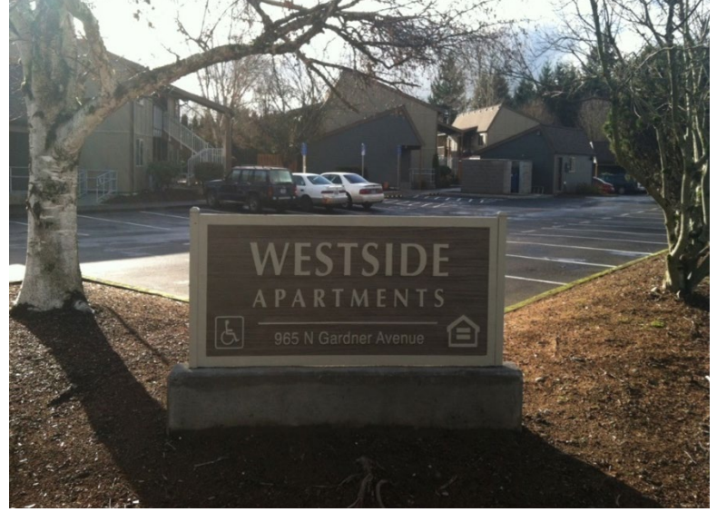
Westside – Low Income Family 1- and 2-bedroom units