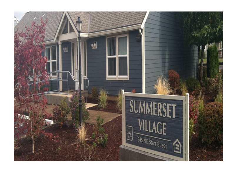
Summerset Senior Sublimity 1- and 2-bedroom units