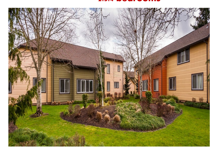
Nuevo Amanecer I, Woodburn 2.3 and 4 bedrooms