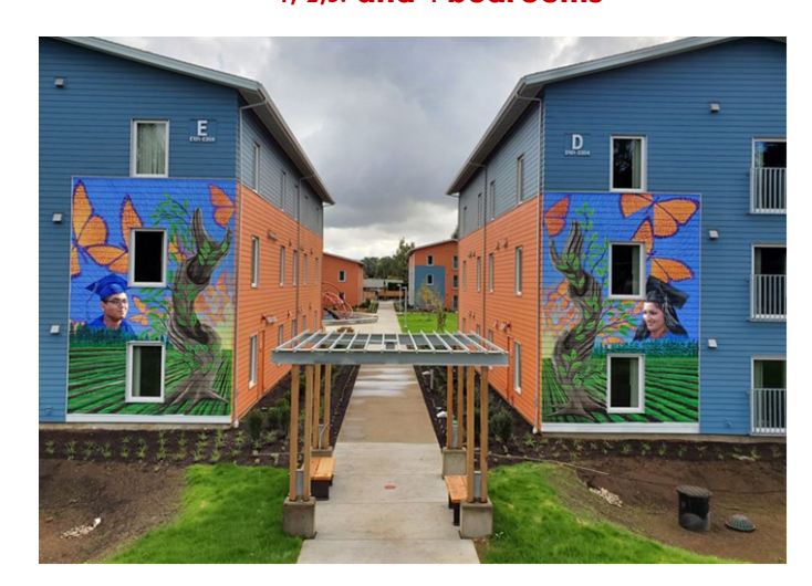
Colonia Unidad, Independence 2.3. bedrooms / Workforce & Farmworker