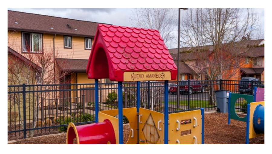
Nuevo Amanecer II, Woodburn 2.3 and 4 bedrooms