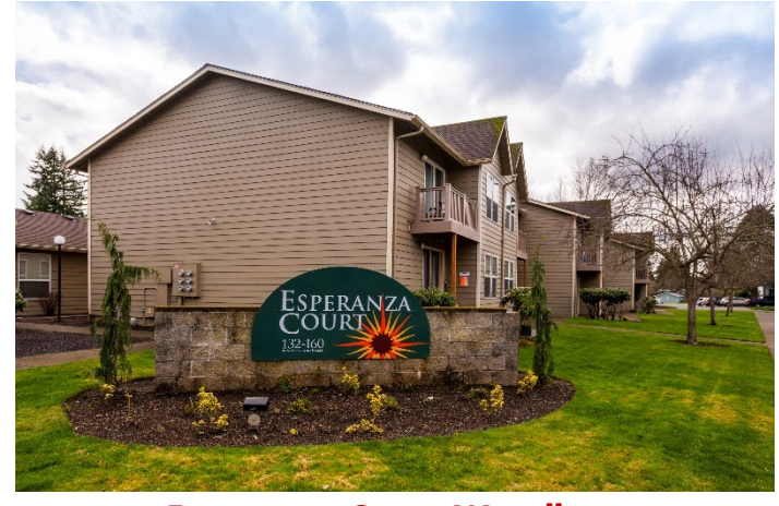
Esperanza Court, Woodburn 2 bedrooms