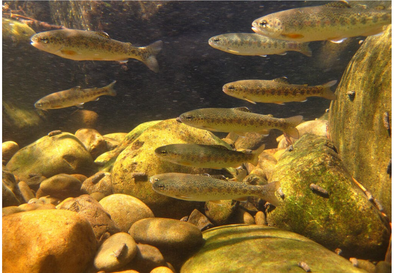
Juvenile steelhead / Oncorhynchus mykiss