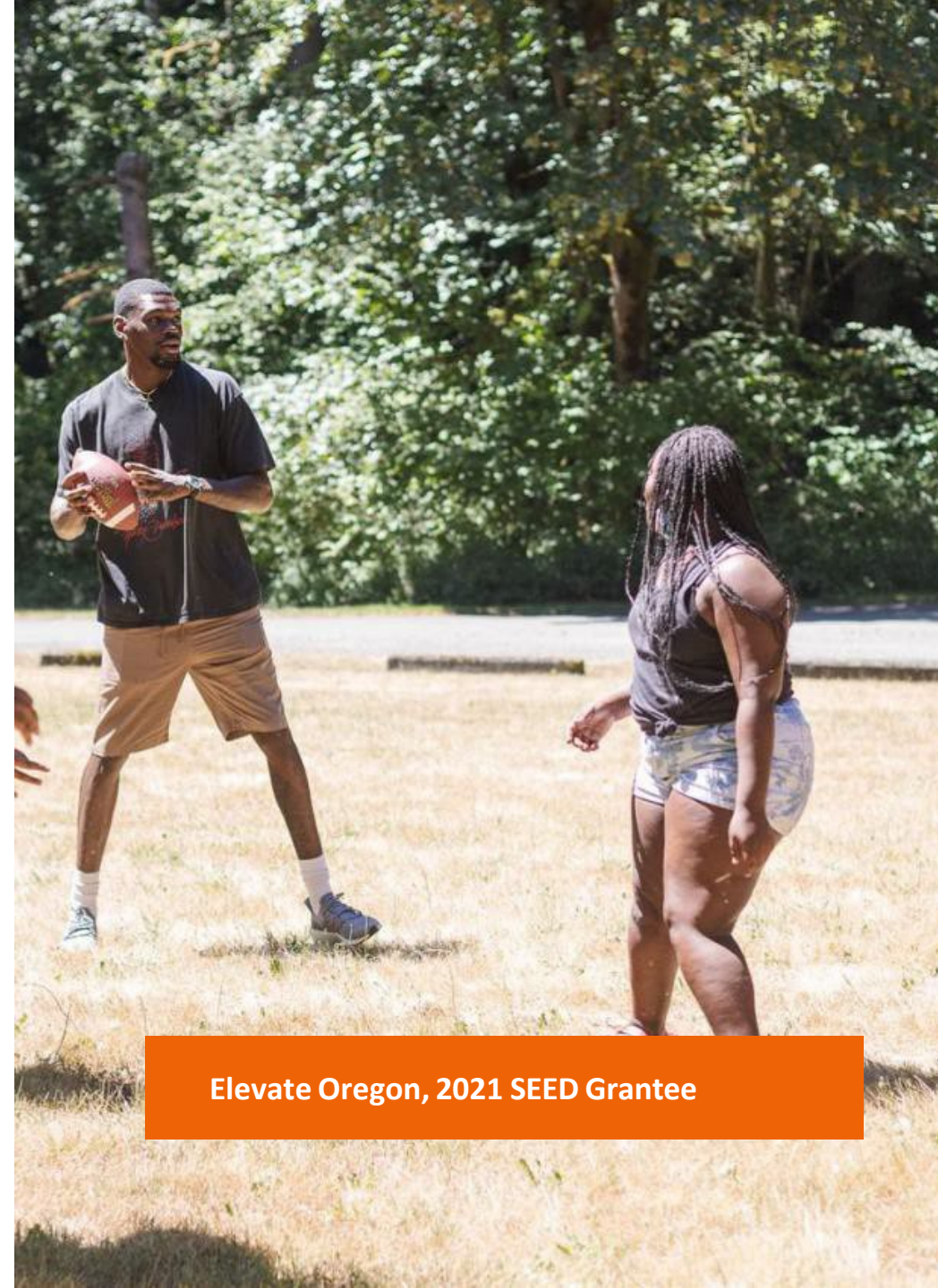
Elevate Oregon, 2021 SEED Grantee

Launched in 2017, SEED Initiatives (formerly Cannabis Social Equity Grants) is the first U.S. government program to fund equity-centered community investment grants from local cannabis tax revenue.