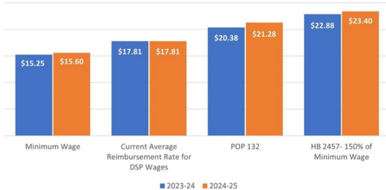
DSP Hourly Wage