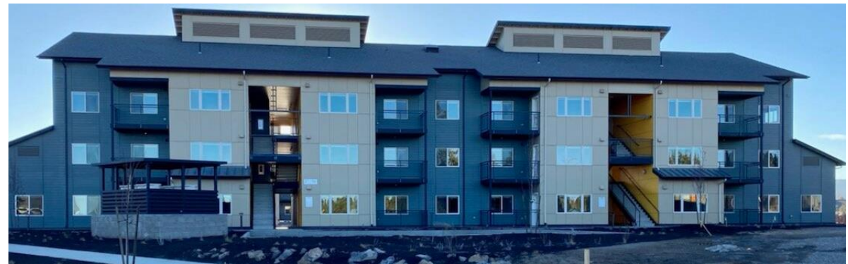
Canal Commons, Bend, OR