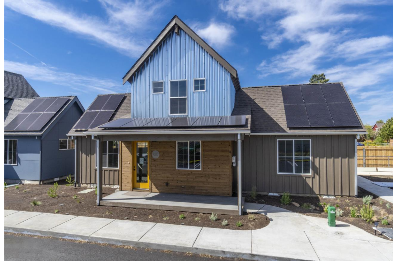
Hurita Place - Bend, OR - Kôr Community Land Trust