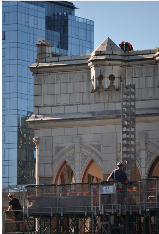
Chaucer Court, Portland, OR