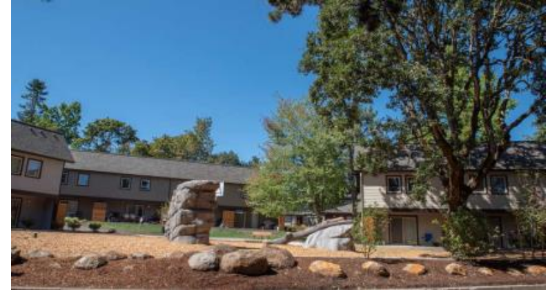
Sunnyslope Manor, Salem, OR