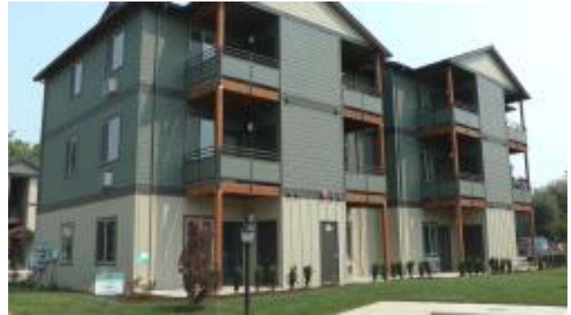
Cornerstone – Salem, OR