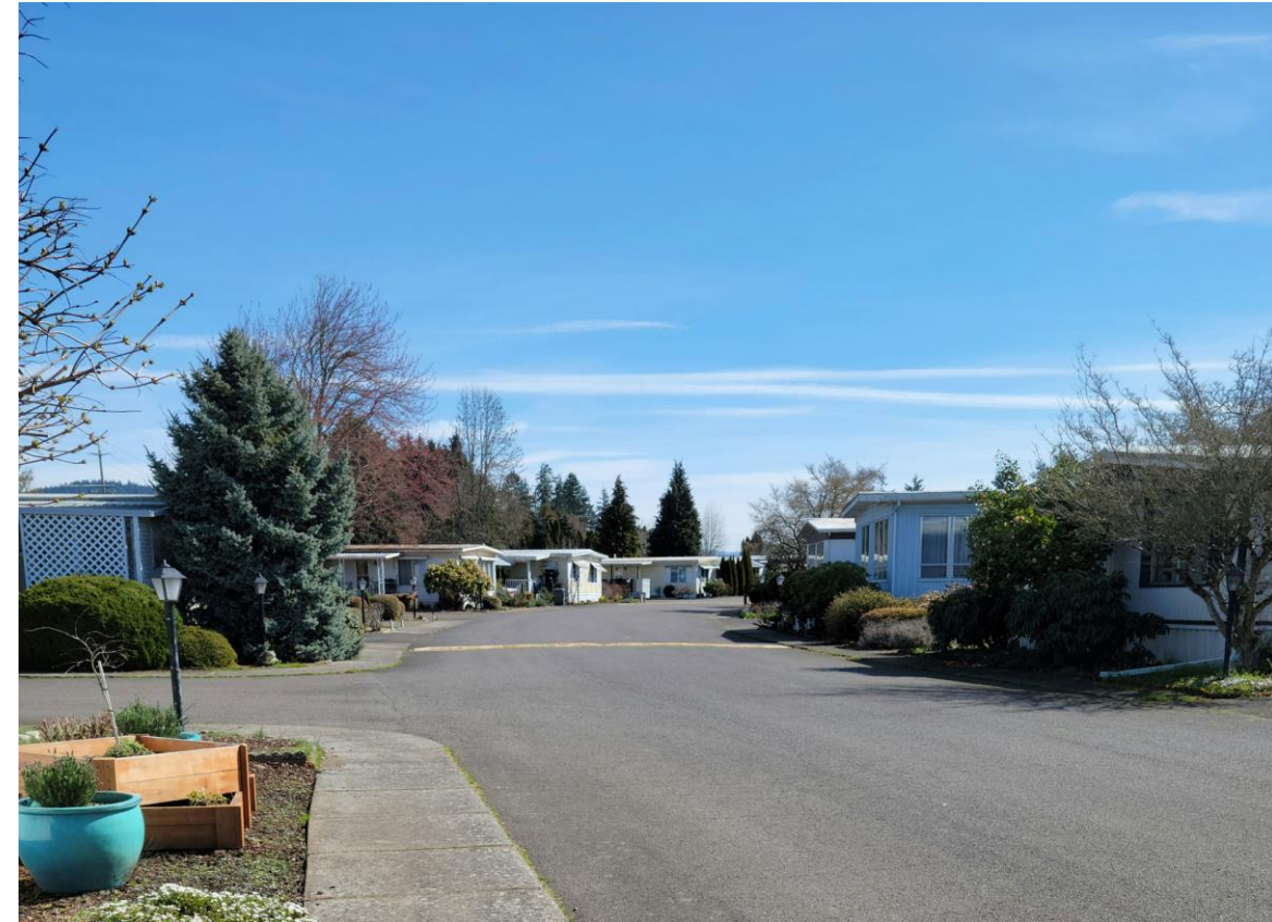
Filbert Grove Cooperative Springfield, OR