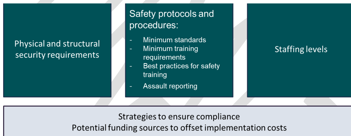
Exhibit 2. HB 4002 and Policy Domains of Focus