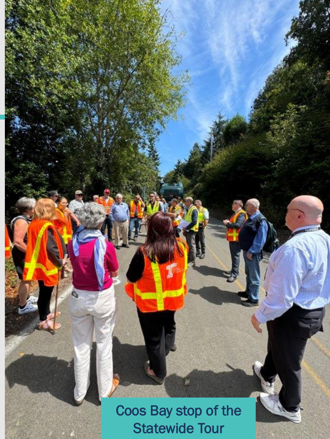
Coos Bay stop of the Statewide Tour