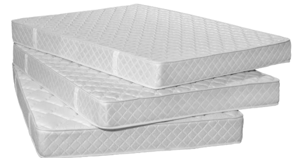
Mattress Recycling Program