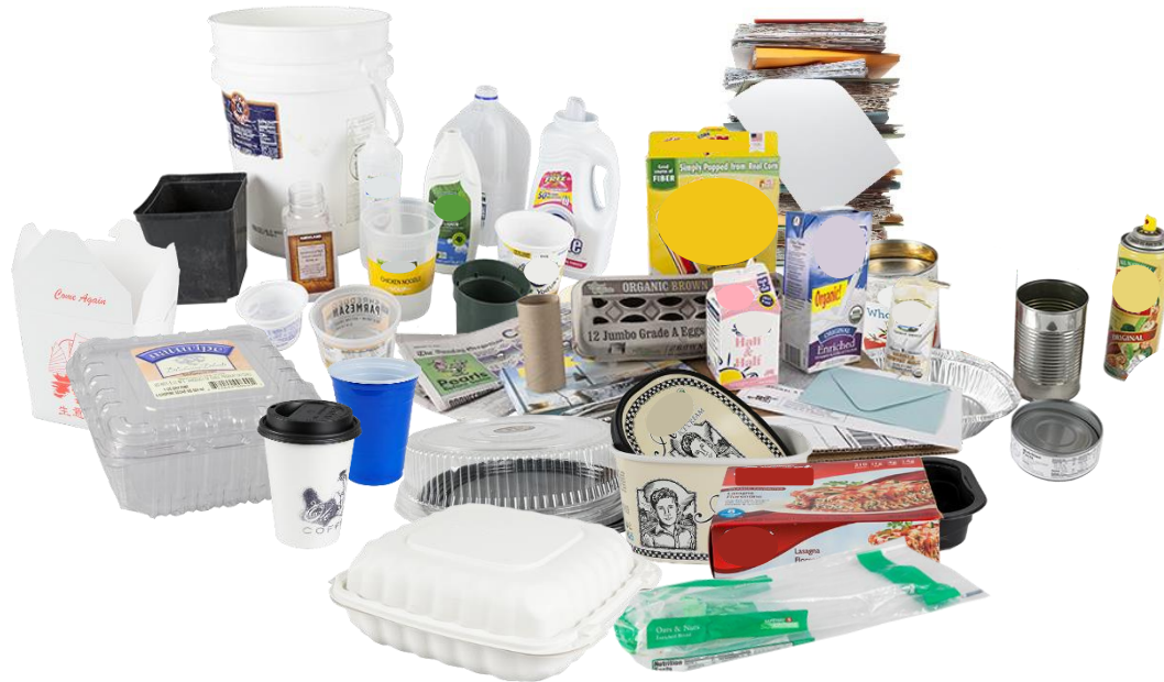
Printed paper, packaging and food serviceware (July 1, 2025, start date)