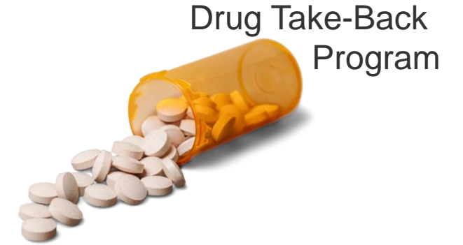
Drug Take-Back Program