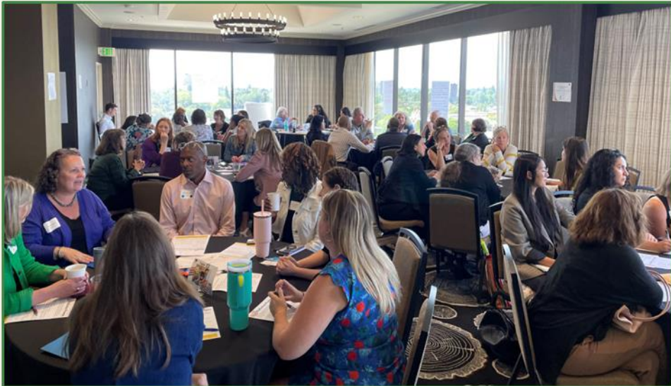
Statewide Summit August 15, 2024