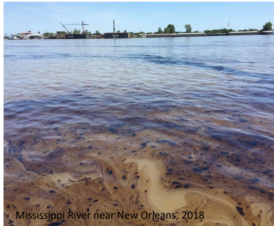
Mississippi River near New Orleans, 2018