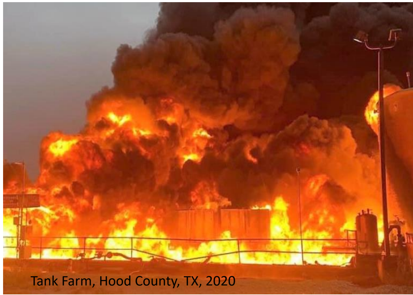
Tank Farm, Hood County, TX, 2020