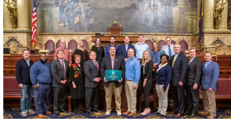
Pennsylvania Oversight Committee