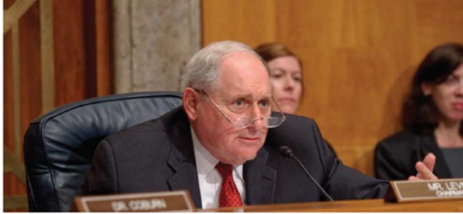
U.S. Sen. Carl Levin