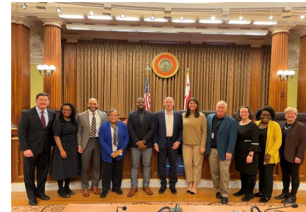
DC Council Oversight Workshop

Workshops for Congress, state, international legislatures Videos, testimony, webinars, social media Research & Reports (50-state analysis, symposium, more) Conferences, panels & events State Oversight Academy Benjamin.Eikey@wayne.edu