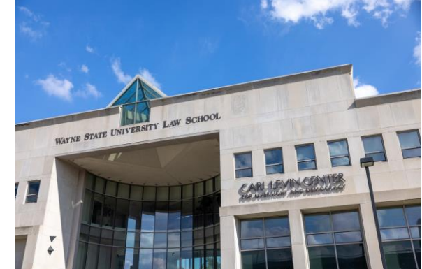
Wayne State Law School