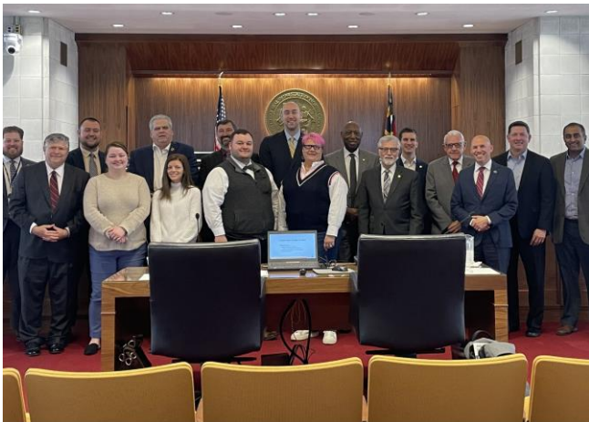
North Carolina General Assembly Oversight Workshop

Workshops for Congress, state, international legislatures Videos, testimony, webinars, social media Research & Reports (50-state analysis, symposium, more) Conferences, panels & events State Oversight Academy Benjamin.Eikey@wayne.edu