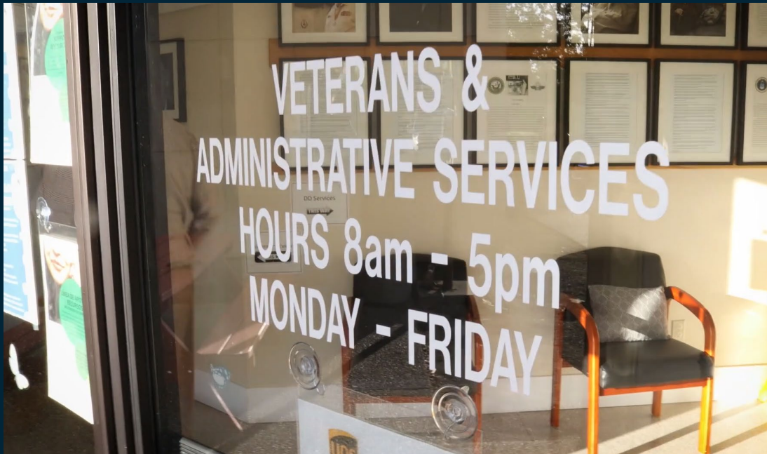
Yamhill County Veteran Services Office