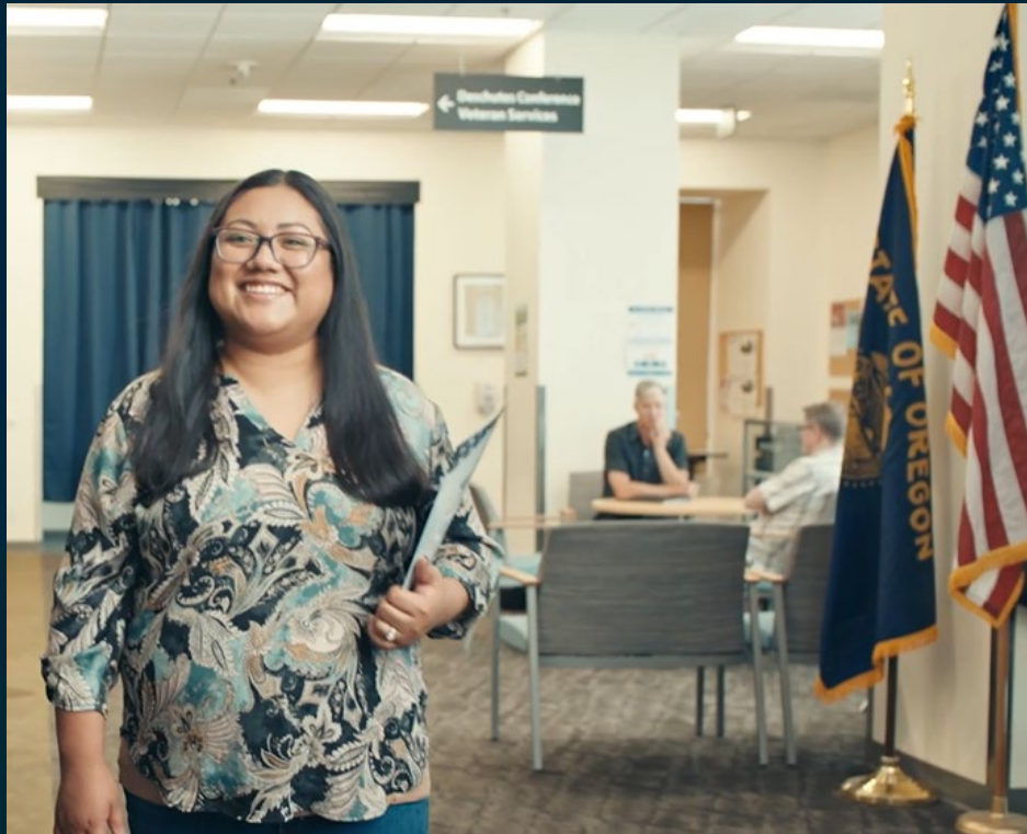
Deschutes County Veteran Services Office