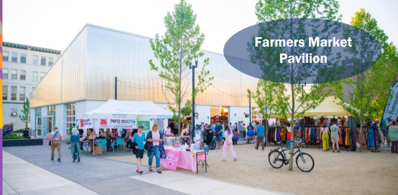
Farmers Market Pavilion