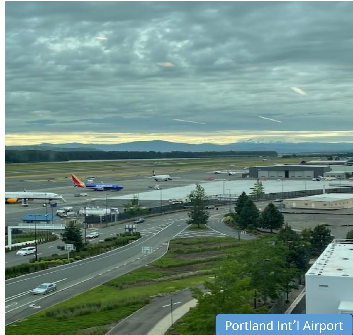
Portland Int'l Airport