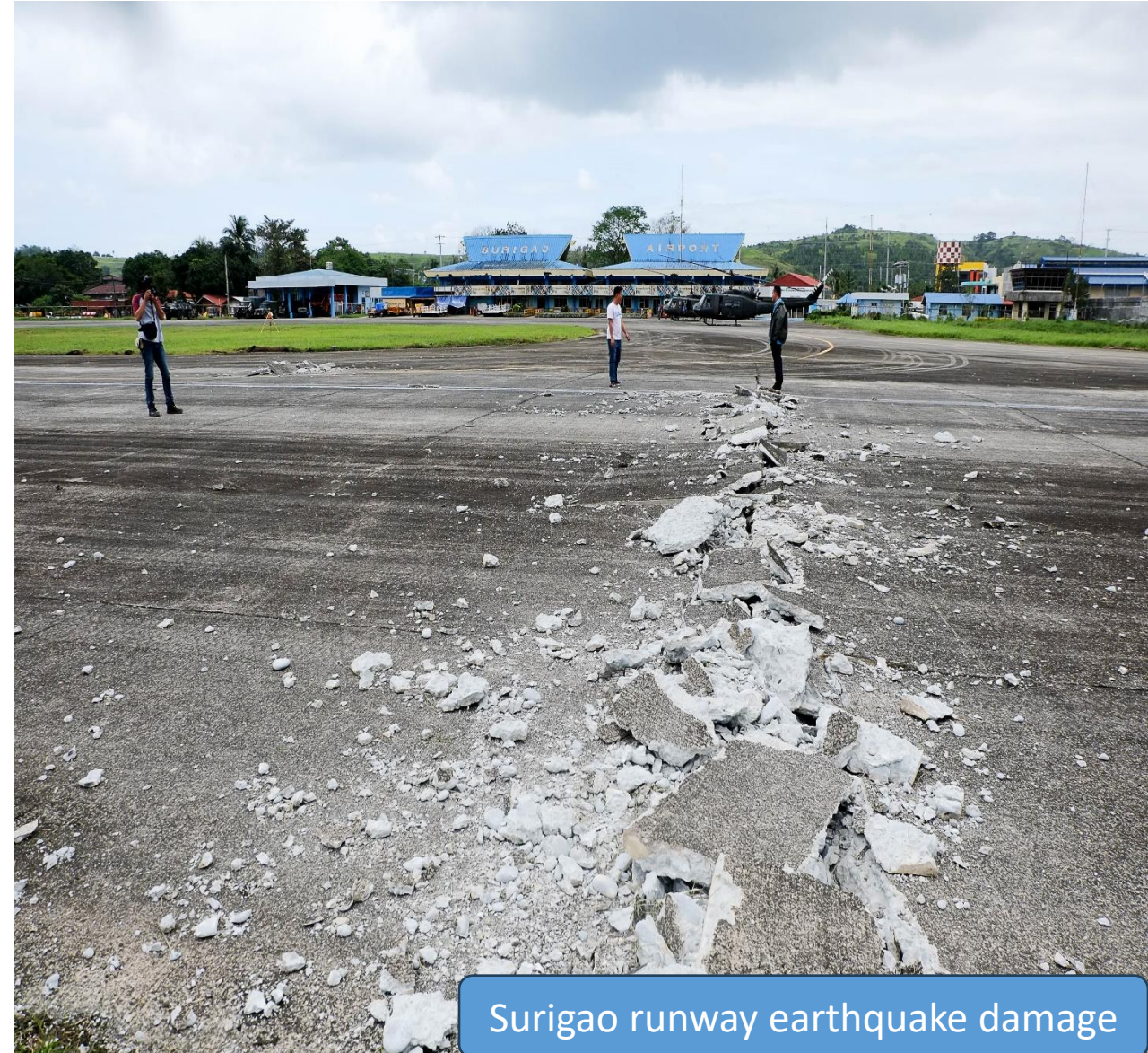
Surigao runway earthquake damage