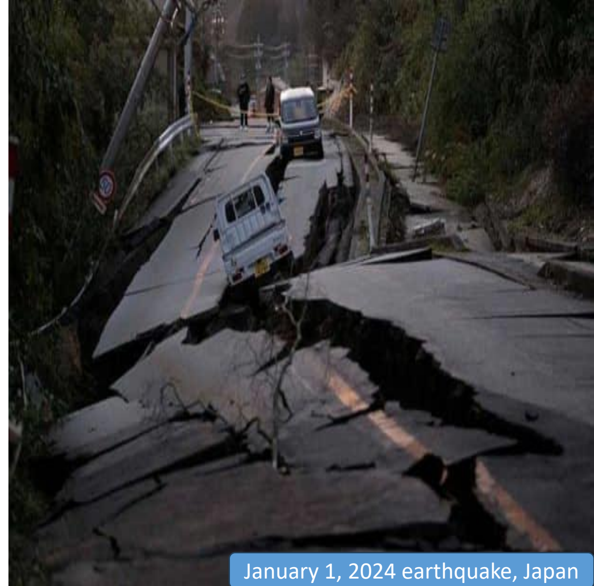
January 1, 2024 earthquake, Japan